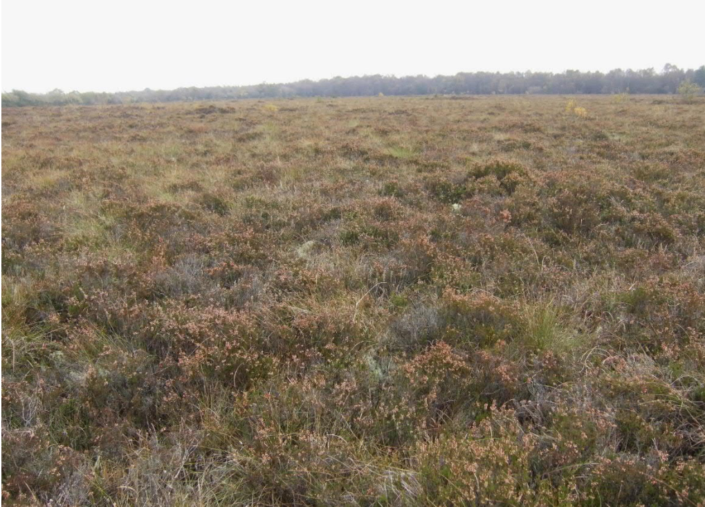
Figure 54: View of high bog in southwest sector of Lismanny Bog. This area, which is zoned Biodiversity, is considered to conform to the Annex I habitat Degraded raised bog