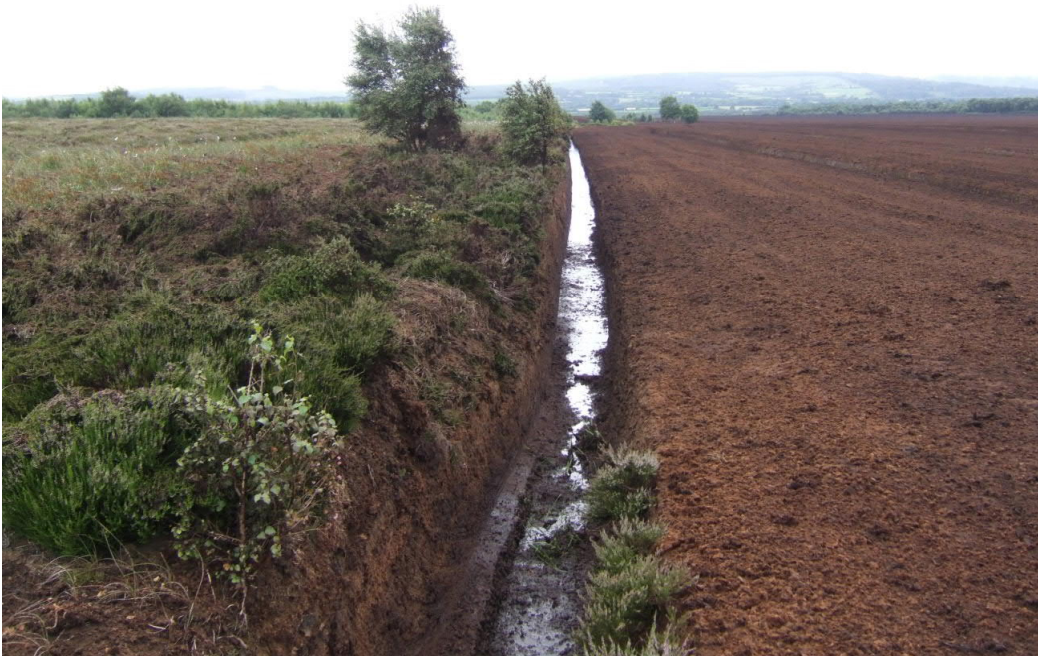
Figure 10: Derrinboy bog: northeast end of western sector (looking southeast). View of deep drain along edge of commercial peat field.