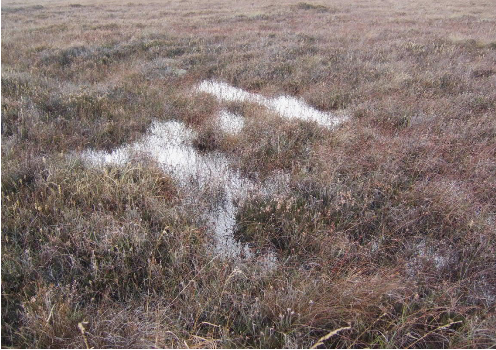
Figure 33: View of Annex I Degraded raised bog to north of sector C. A wet area close to the southern margin supports the Annex I habitat Depressions on peat substrates (Rhynchosporian). Species such as Menyanthes trifoliata were recorded in July 2016 (photo taken in November 2016)