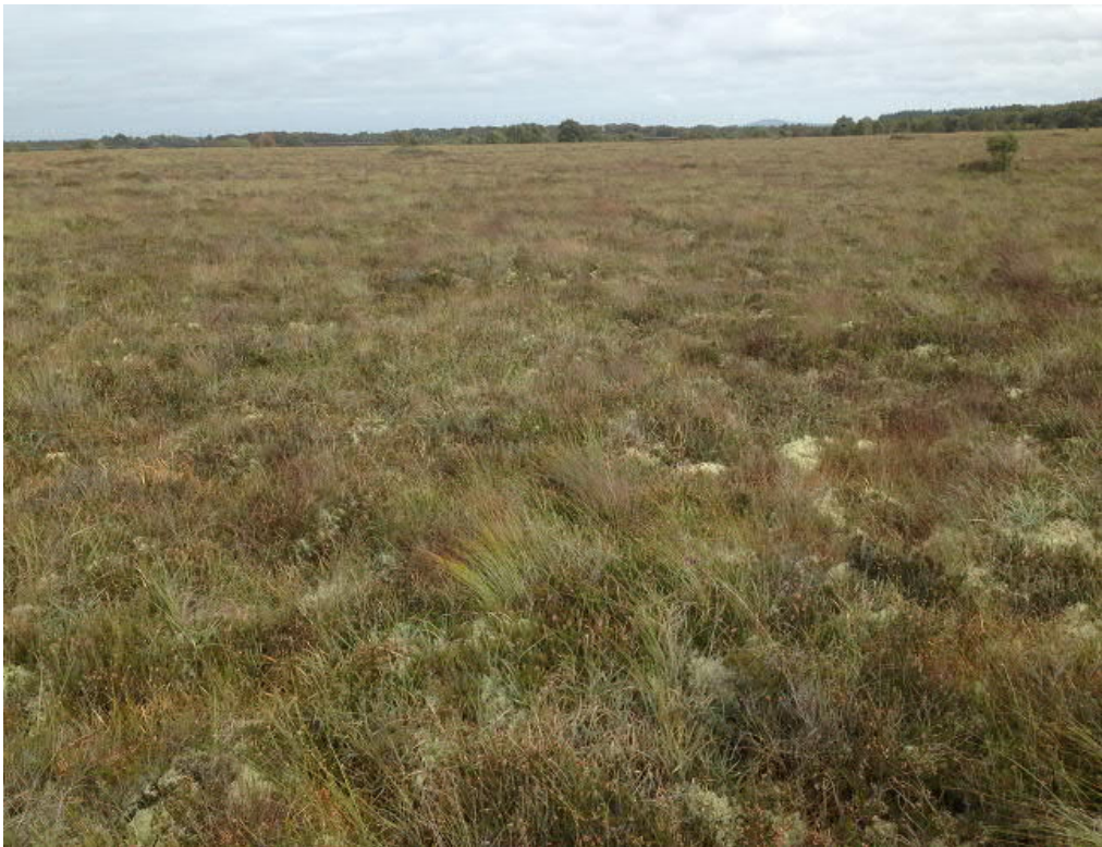
Figure 88: High Bog to the southeast of the Moundillon site that supports the Annex I habitats Degraded raised bog and Depressions on peat substrate of the Rhynchosporion