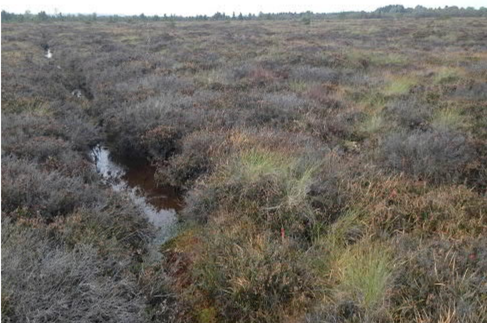
Figure 69: Photograph facing north in the northeastern sector of the Coolcraff site showing area of Degraded raised bog capable of natural regeneration