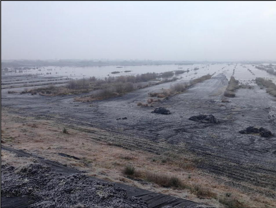
Figure 83: Flooded area in the western sector of Knappogue Bog 192 whooper swans were recorded roosting in this area during November 2016