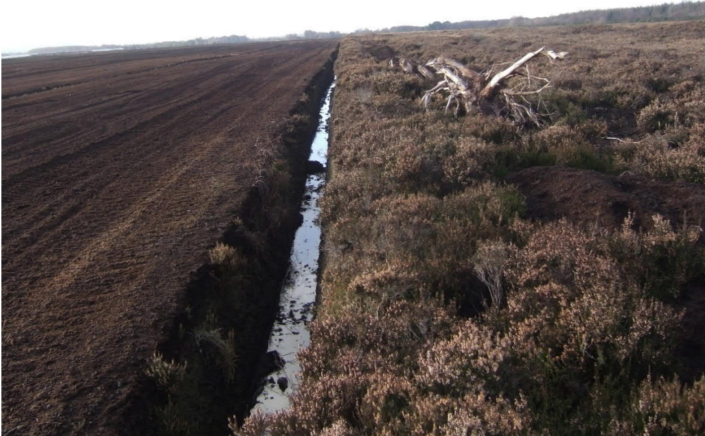
Figure 61: Garrymore Bog, north end. View of deep drain along edge of commercial peat field, looking westwards.