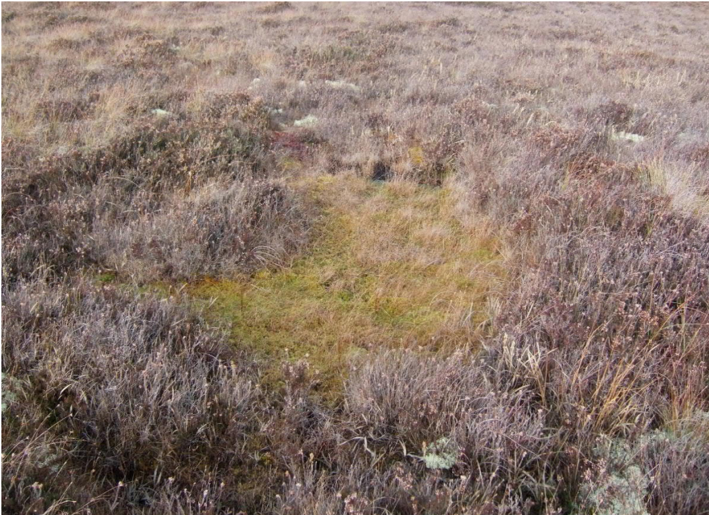
Figure 60: Parts of the high bog are wet, with Sphagnum mosses and Rhynchospora alba frequent