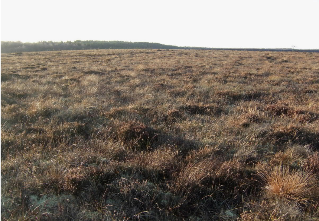
Figure 15: Killaun Bog: view of high bog in southern sector (looking northeast). This large area is classified as Degraded raised bog and supports the Annex I habitat Depressions on peat substrates (Rhynchosporian)