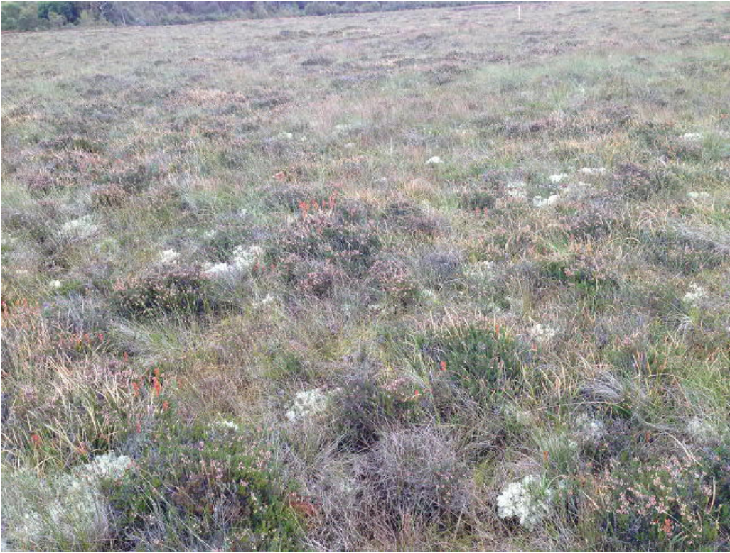
Figure 79: High Bog in the mid- sector of Granaghan Bog supporting the Annex I habitat Degraded raised bog.