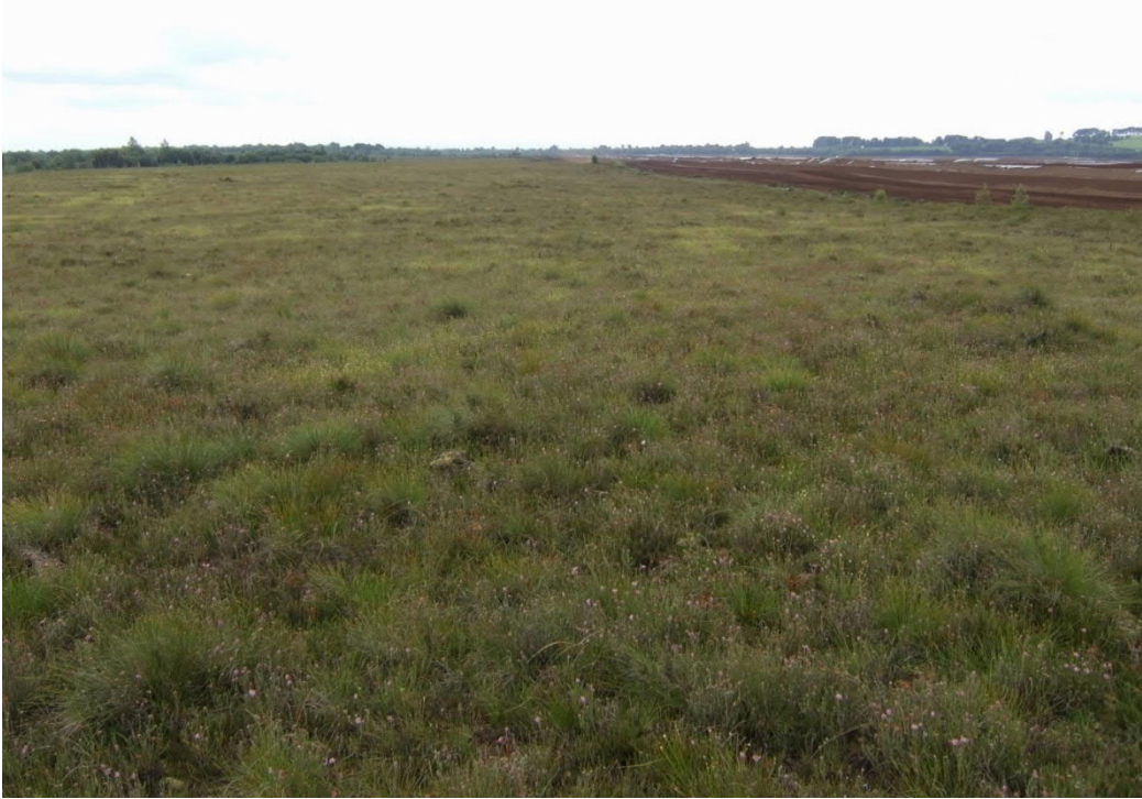
Figure 3: Bellair North Bog: east end (looking south). Image of area of high bog that adjoins commercial peat field – this large area is classified as Degraded raised bog and includes good examples of the Annex I habitat Depressions on peat substrates (Rhynchosporian)