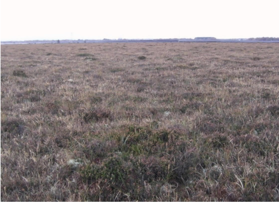
Figure 34: View of high bog at northeast end of Cornafulla Bog (looking northwest). This area is considered to conform to the Annex I habitat Degraded raised bog