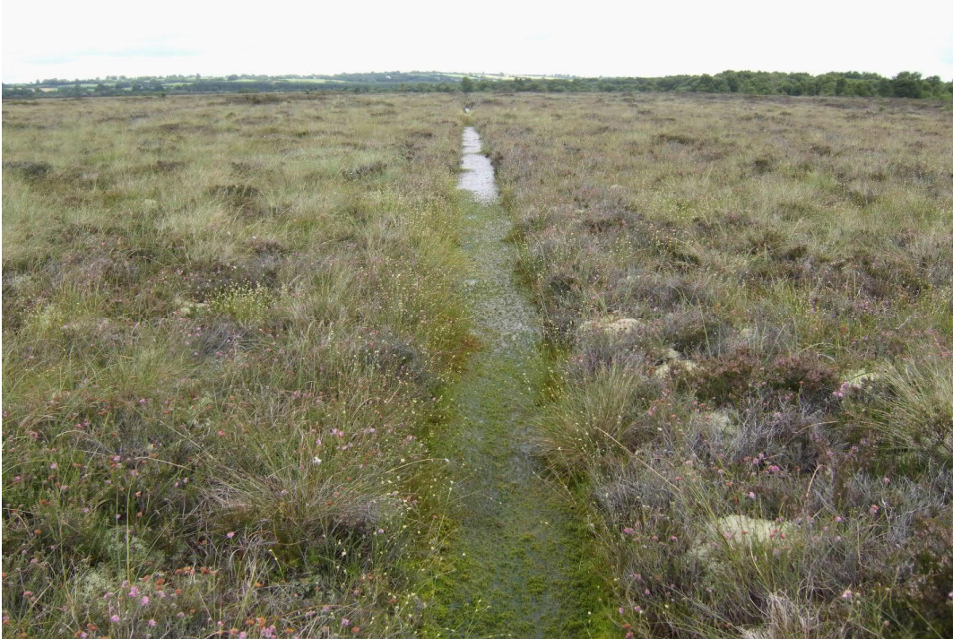
Figure 19: Monettia Bog: view of high bog in southeast sector. This large area is classified as Degraded raised bog and supports the Annex I habitat Depressions on peat substrates (Rhynchosporian). Surface drains have now mostly filled in with Sphagnum spp., Rhynchospora alba and Eriophorum angustifolium