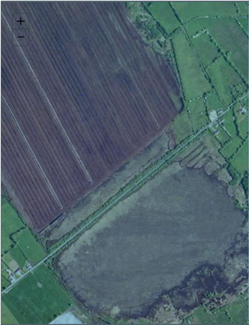
Figure 66: High Bog to the South of the Production Fields