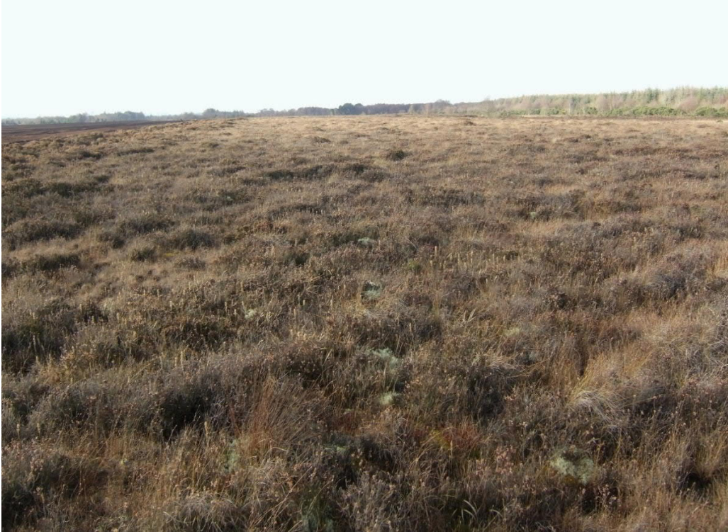
Figure 59: View of remnant high bog at northern end of Garrymore Bog, looking westwards. This high bog area is classified as the Annex I habitat degraded raised bog