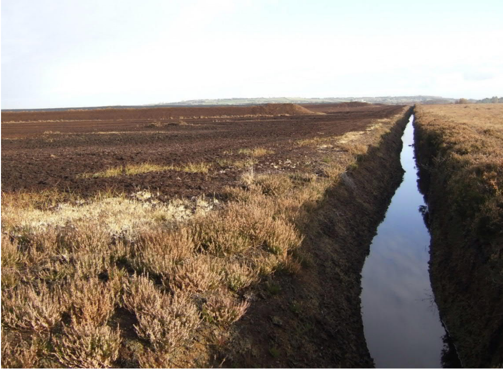
Figure 24: View of southern margin of Clonlyons Bog pNHA. The site has been developed commercially, with remnant strips of high bog adjoining the peat fields. View is looking eastwards from southwest corner of site