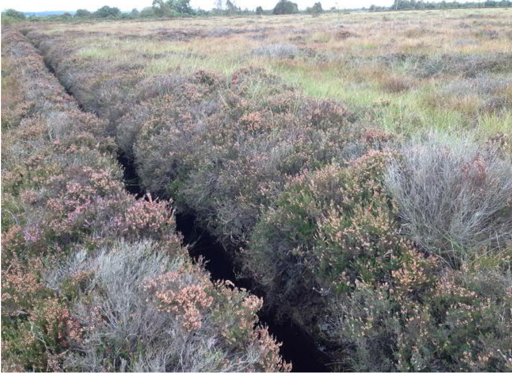
Figure 80: One of two drains alongside vehicular route that run adjacent to remnant high bog in the mid- sector of Granaghan Bog