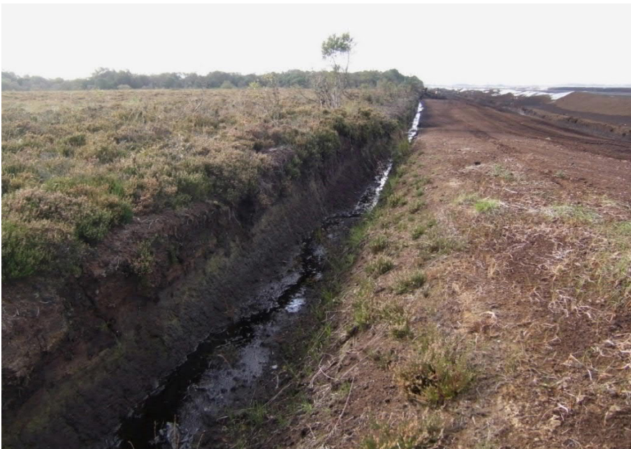
Figure 52: View of margin of high bog in northeast sector of survey area. This area of bog is mostly within the River Shannon Callows SAC and the Middle Shannon Callows SPA. Looking southwards along drain between high bog and peat field