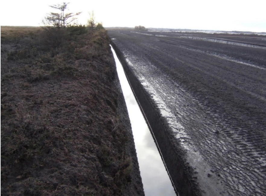
Figure 35: View of drain at edge of high bog at northeast end of Cornafulla Bog (looking southeast). Note wet peat thrown up on edge of high bog from recent drain clearing