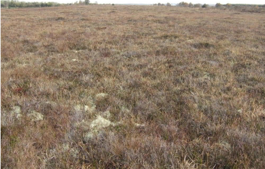
Figure 25: View of high bog along northeast boundary of Blackwater Bog (looking eastwards). This bog is considered to conform to the Annex I habitat Degraded raised bog and supports the Annex I habitat Depressions on peat substrates (Rhynchosporian)