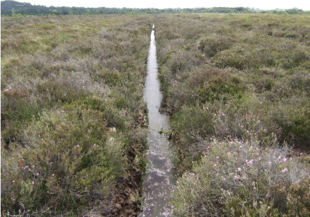
Figure 2: Bellair North Bog: west end. Image of well-vegetated high bog that has been ditched and probably scraped of surface vegetation in the past. However, the bulk of the peat mass is still present and drains are becoming filled in with vegetation. This area is considered as the Annex I habitat Degraded raised bog