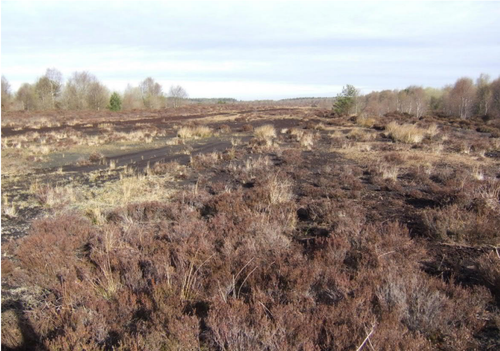
Figure 21: Ballivor Bog - view of regenerating cutaway vegetation in western part of site.