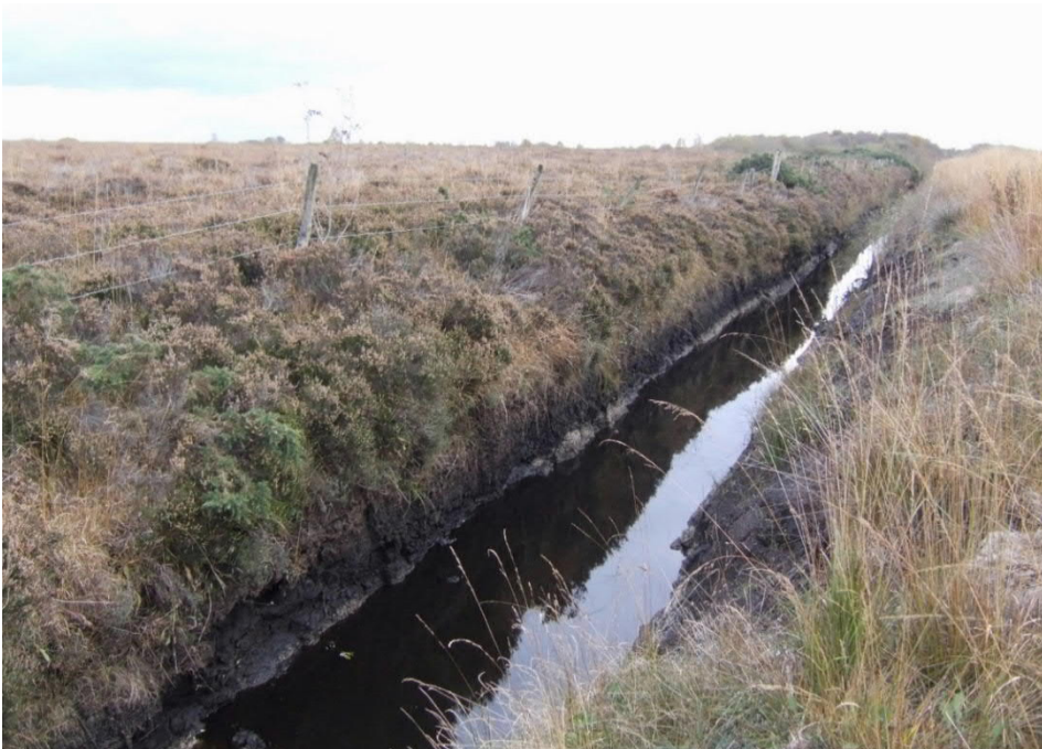
Figure 26: View of drain along southwest boundary of Fin Lough SAC (looking eastwards). Image shows raised bog which merges with Annex I habitat Alkaline Fen