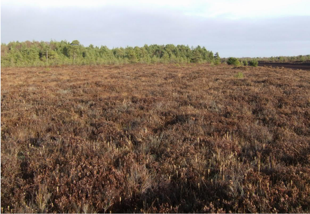
Figure 11: Derryclure Bog: view of high bog with mixed woodland (looking northwards over eastern block). This area has been zoned a Bord na Móna biodiversity area.