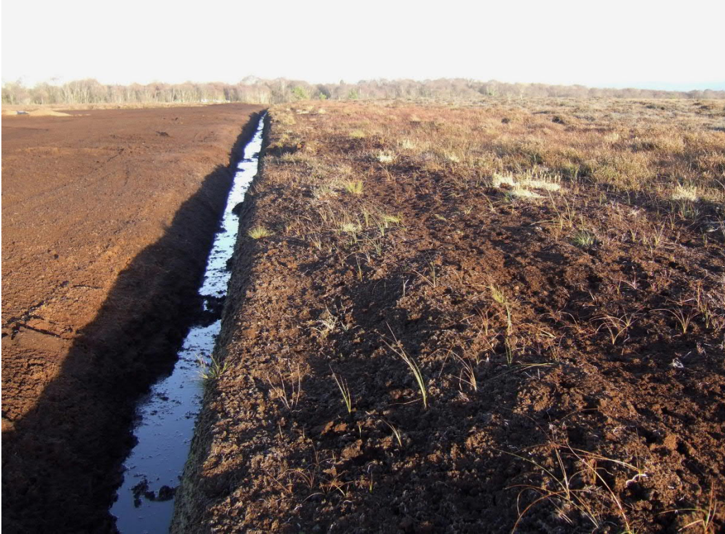
Figure 16: Killaun Bog: view of deep drain along edge of high bog in southern sector (looking eastwards). Note also the wet peat that has been sprayed onto the edge of the bog during drain maintenance operations