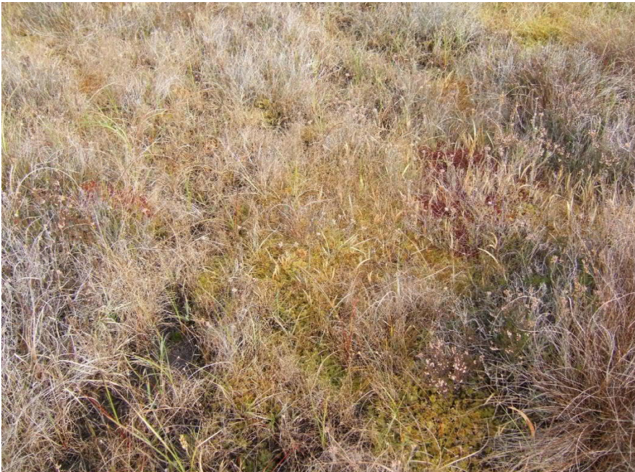
Figure 43: The high bog at the eastern end of Cullighmore Bog also supports the Annex I habitat Depressions on peat substrates (Rhynchosporian)