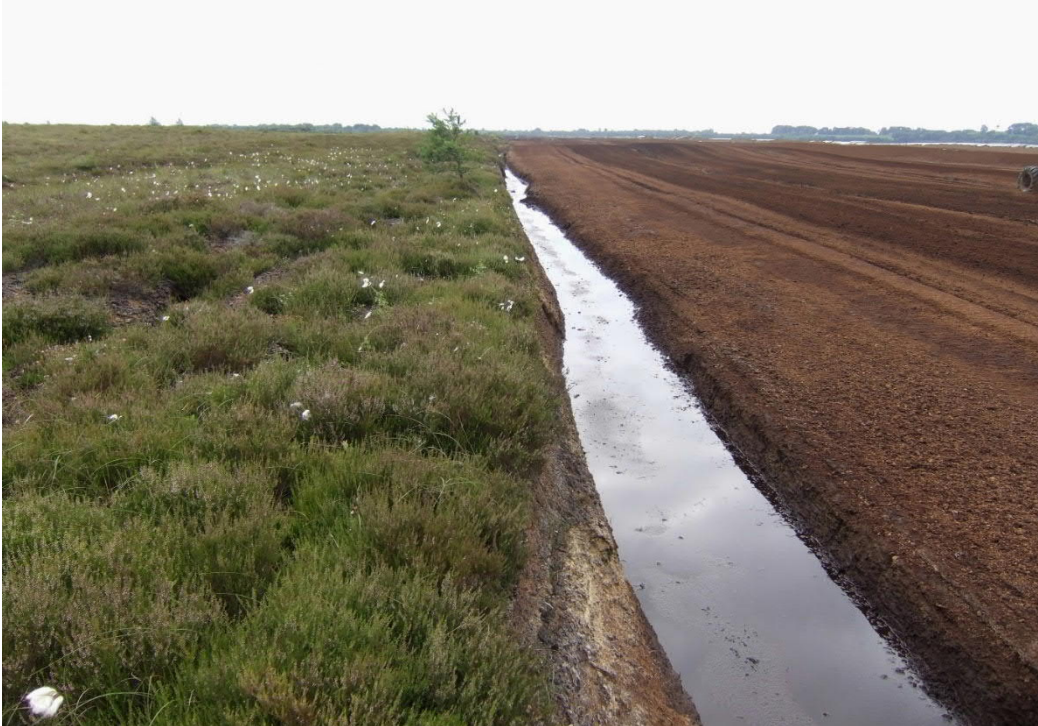
Figure 8: Bellair North Bog: east end. Image (looking southwards) of deep drain between high bog and commercial peat field