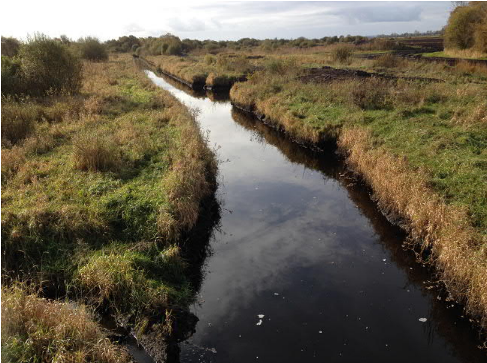
Figure 78: Bilberry River that flows through the Edera site facing west from vehicular bridge.