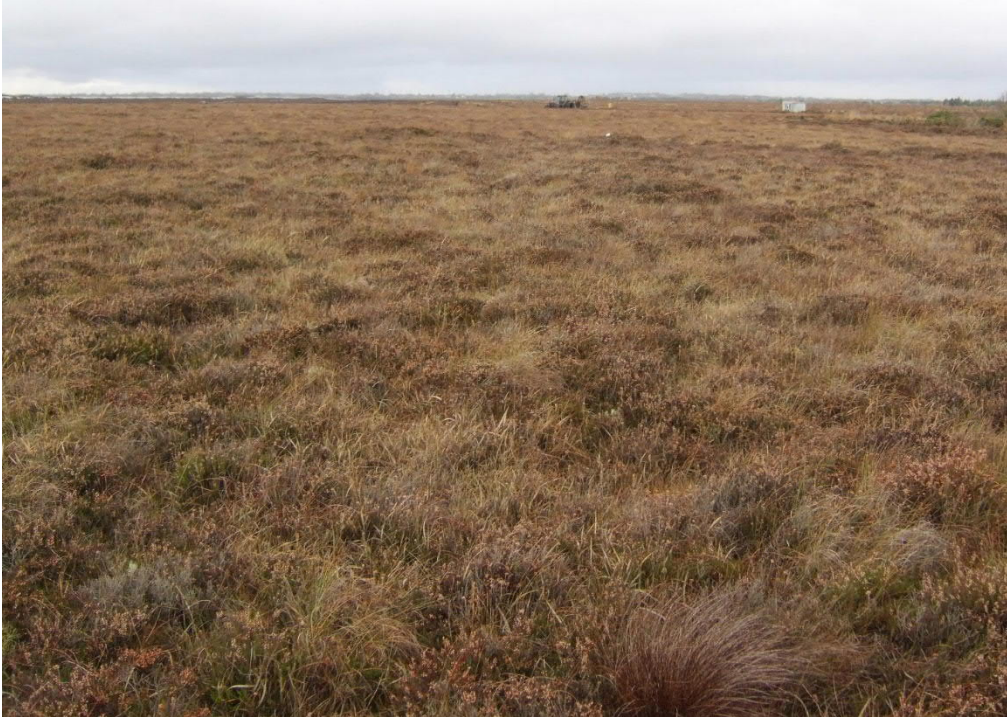
Figure 39: View of Annex I Degraded high bog in southeast sector of Cornafulla Bog – this area of high bog has a central wet zone with pools and supports the Annex I habitat Depressions on peat substrates (Rhynchosporian)