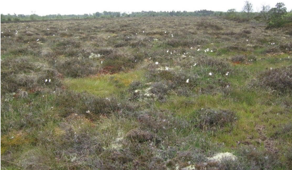
Figure 92: Coolnacartan bog: view of small area of remnant high bog in south-east sector of site