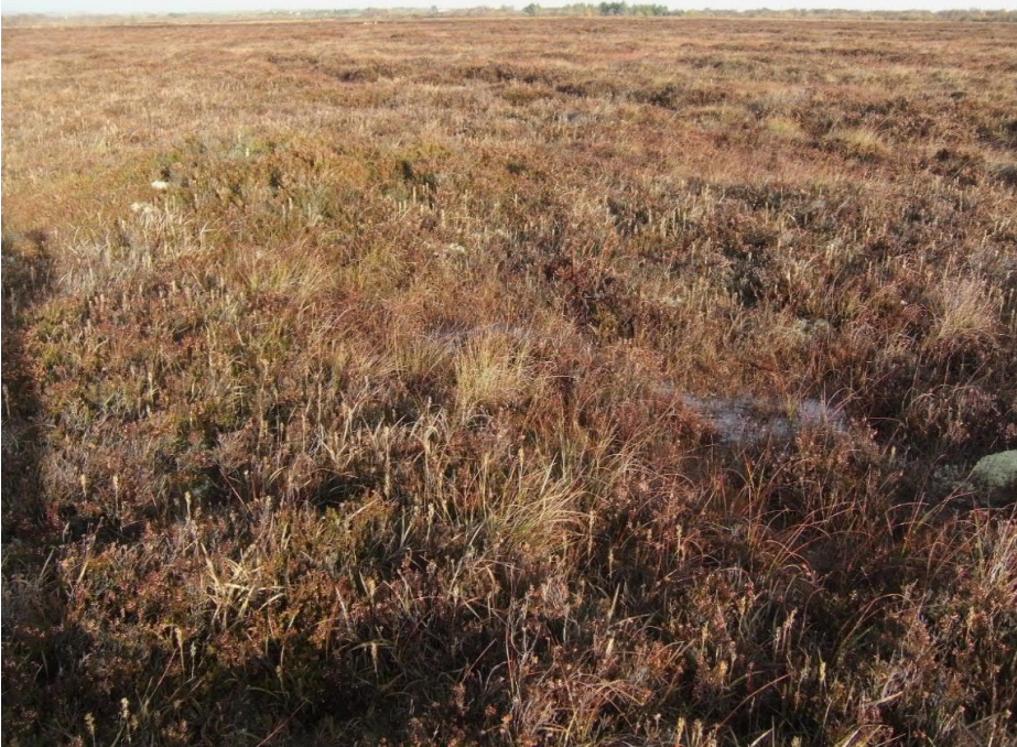
Figure 37: View of Annex I Degraded high bog in southeast sector – this area has been ditched in the past