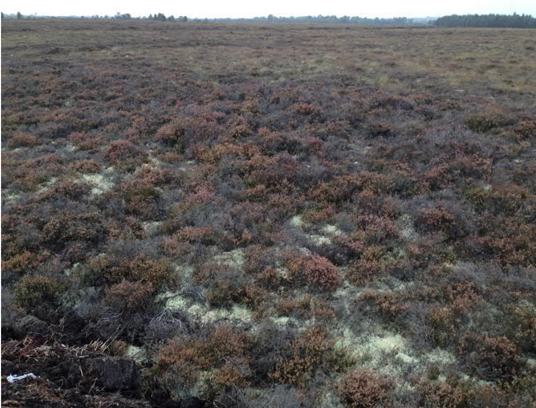
Figure 87: Photograph facing northwest of high bog (PB1) previously drained to the north of the Milkernagh site