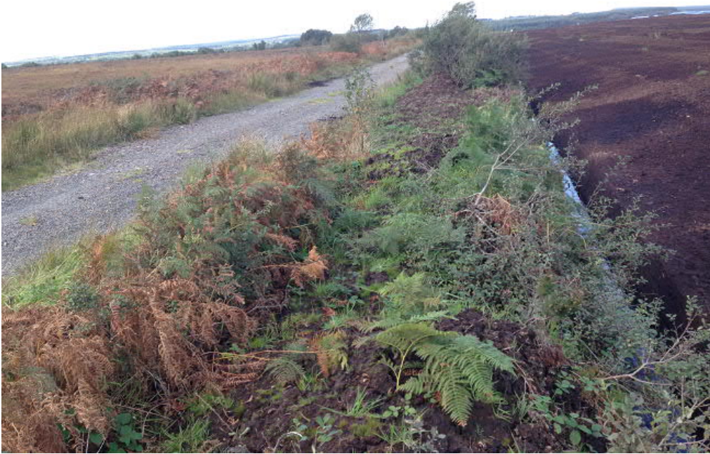
Figure 75: Photograph facing northeast along bog road between recently developed peat field on the right and intact high bog that supports the Annex I habitats Degraded raised bog and Depression of the Rhynchosporion