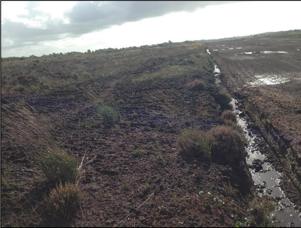
Figure 82: Photograph facing northwest along drain at area of high bog (PB1) along the western boundary of the site