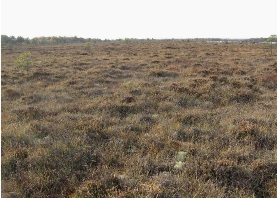
Figure 42: View of high bog at eastern end of Cullighmore Bog. This area is considered to conform to the Annex I habitat Degraded raised bog