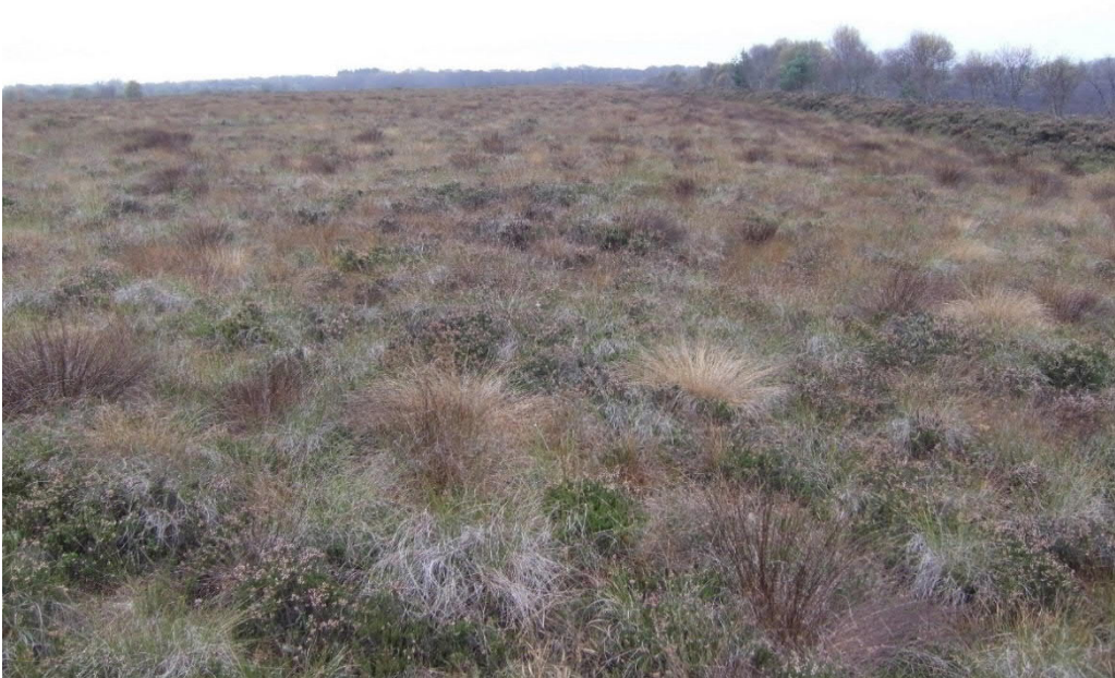
Figure 58: View of remnant high bog along eastern margin of Esker Bog, looking southwards. This bog is in a disturbed state mainly due to local cutting. November 2016