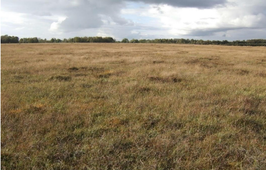
Figure 53: View of southern part of high bog in northeast sector of survey area. This area of bog is partly within the River Shannon Callows SAC and the Middle Shannon Callows SPA. Looking north-eastwards over high bog