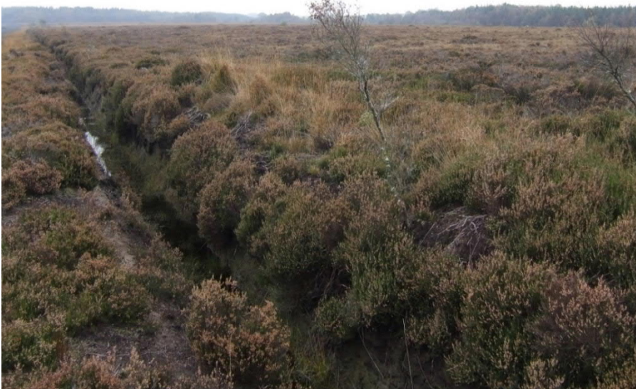
Figure 48: View of high bog in southwest of survey area. This extensive area of bog conforms to the Annex I habitat Degraded raised bog. The picture shows the high bog and the drain (on left) which separates it from the commercial peat fields