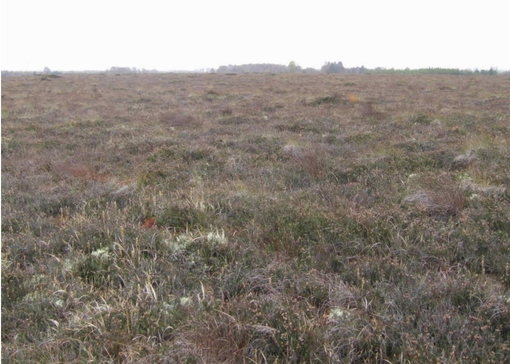
Figure 62: View of high bog along northwest margin of Mountlucas bog, looking southwards. This bog remnant is largely intact. November 2016