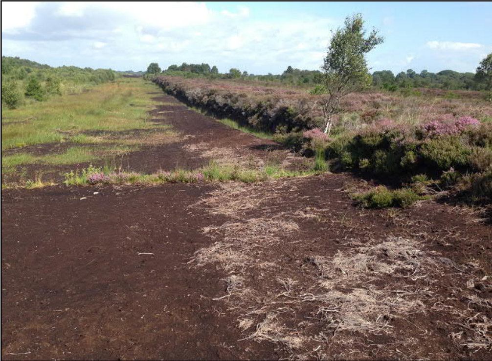
Figure 85: Re-vegetating peat field along bank face on the western edge of Derry Lough pNHA. Photograph facing north