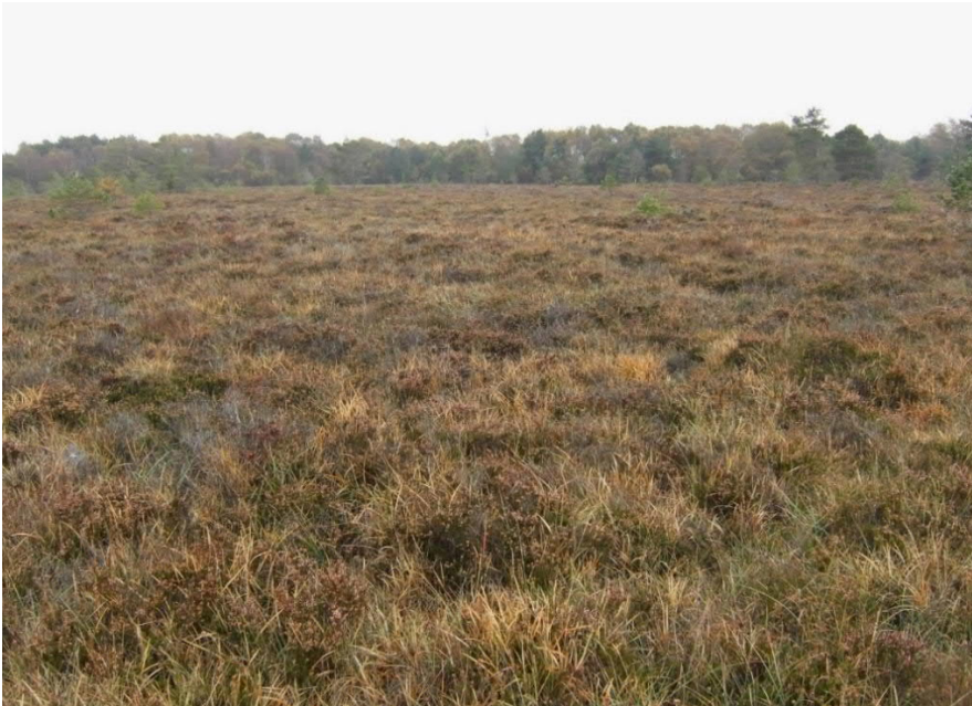
Figure 47: View of high bog in northeast of survey area. This raised bog is within the Shannon Callows SAC and SPA sites