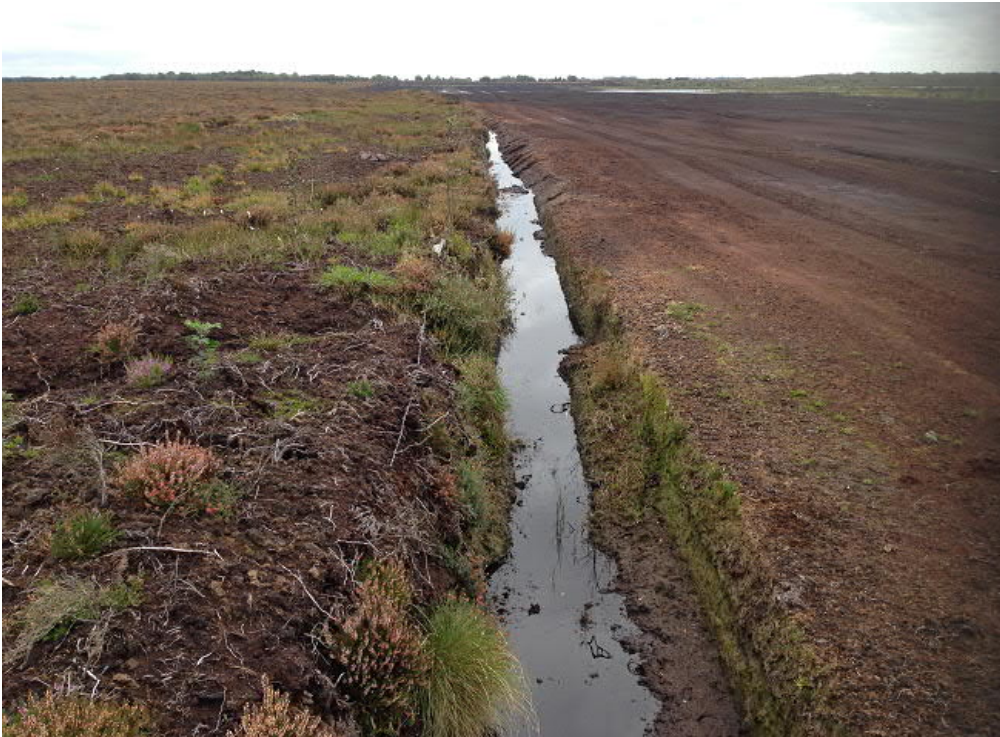
Figure 73: Image facing south of deep drain between peat fields and high bog in the southeast of the Derrycashel Bog site