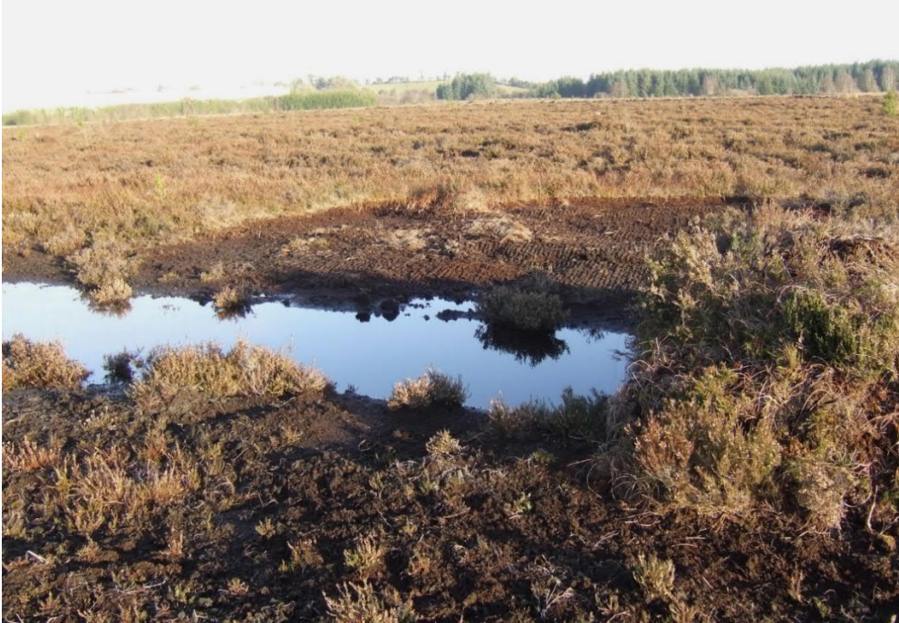
Figure 30: View of high bog in northeast sector of Bunahinly Bog. View is looking north-eastwards over a recently blocked surface drain. This bog shows characters of the Annex I habitat Degraded raised bog