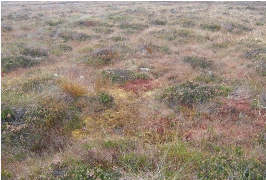
Figure 46: View of high bog in east of survey area. This bog is considered to conform to the Annex I habitat Degraded raised bog. The picture shows a wet area of bog with the Annex I habitat Depressions on peat substrates (Rhynchosporian)