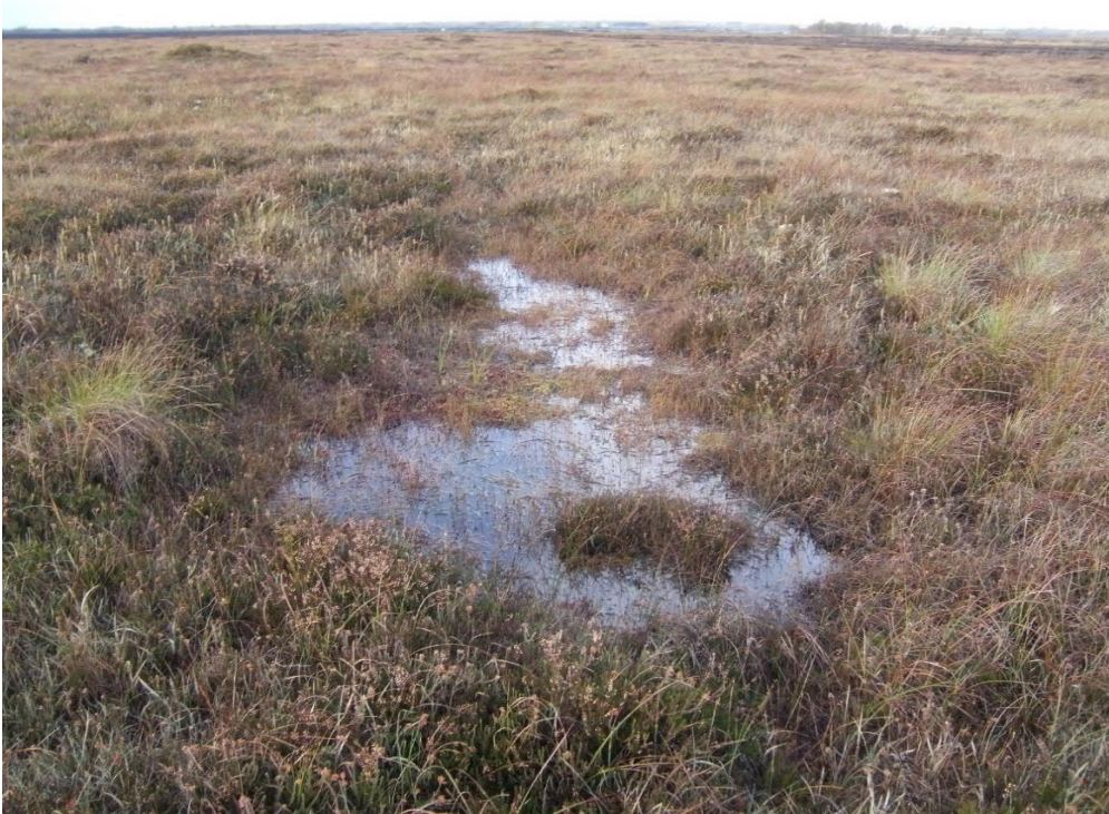
Figure 36: View of quaking area of wet bog with pools in southeast sector of Cornafulla Bog – this area appears to conform to the Annex I habitat Active raised bog