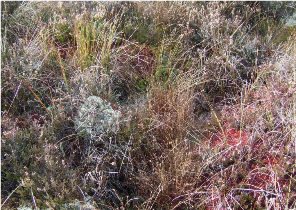
Figure 13: Derryclure Bog: parts of the remaining open high bog are wet and support the Annex I habitat Depressions on peat substrates (Rhynchosporian)