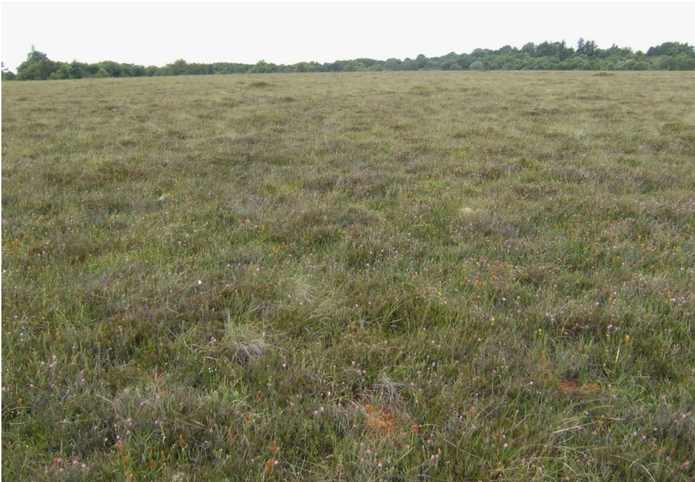
Figure 1: Bellair North Bog: west end. Image (looking northwards and mostly outside Bord na Móna property) shows an area of largely intact raised bog that is classified as the Annex I habitat Degraded raised bog. The Annex I habitat Depressions on peat substrates (Rhynchosporian) is also represented