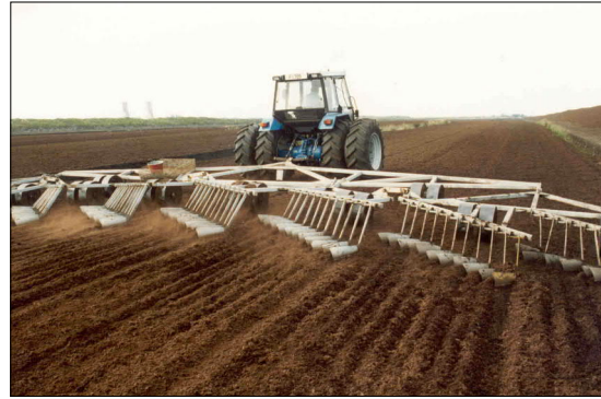
Figure 2: Harrowing