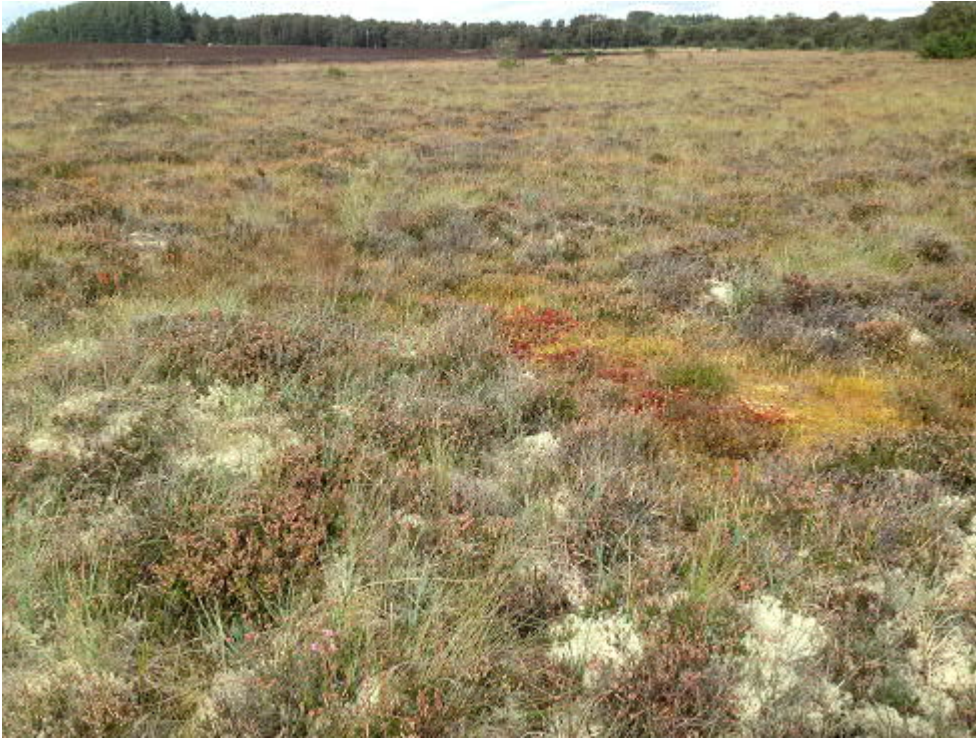
Figure 74: Annex I Degraded raised bog habitat at southern tip of Derrycolumb site