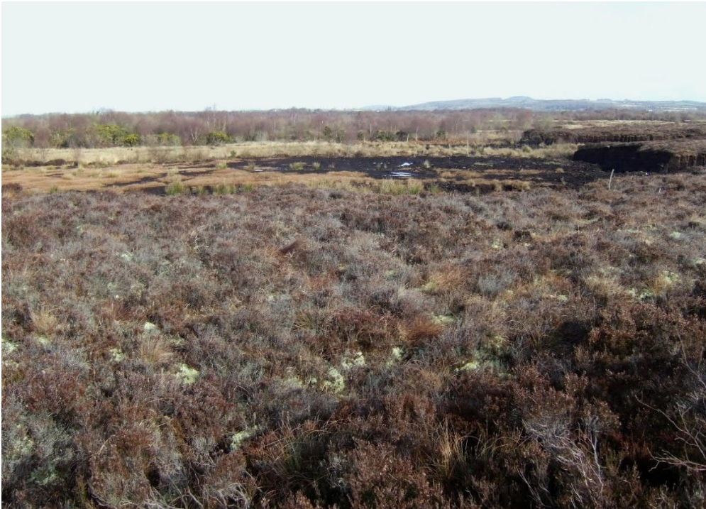
Figure 91: Cashel Bog: View of remnant high bog and cutover bog in northwest sector of site