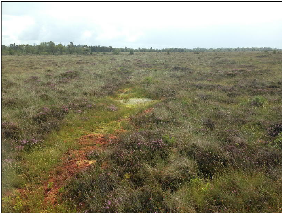
Figure 84: Infilling former drain dominated by Sphagnum spp. in Derry Lough pNHA with the Derryadd 3 Bog site boundary. Photograph facing east