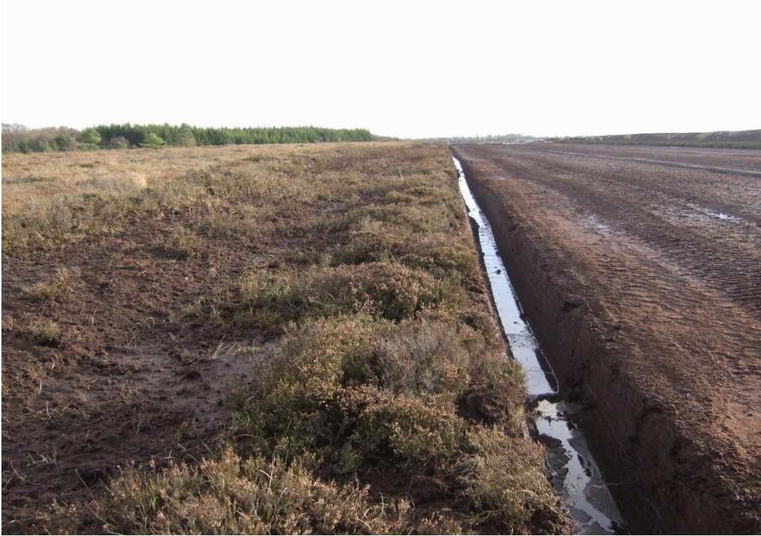
Figure 18: Leamanaghan Bog: view of high bog alongside commercial peat fields in extreme northern sector of site (looking southwards). This high bog is of Local conservation interest