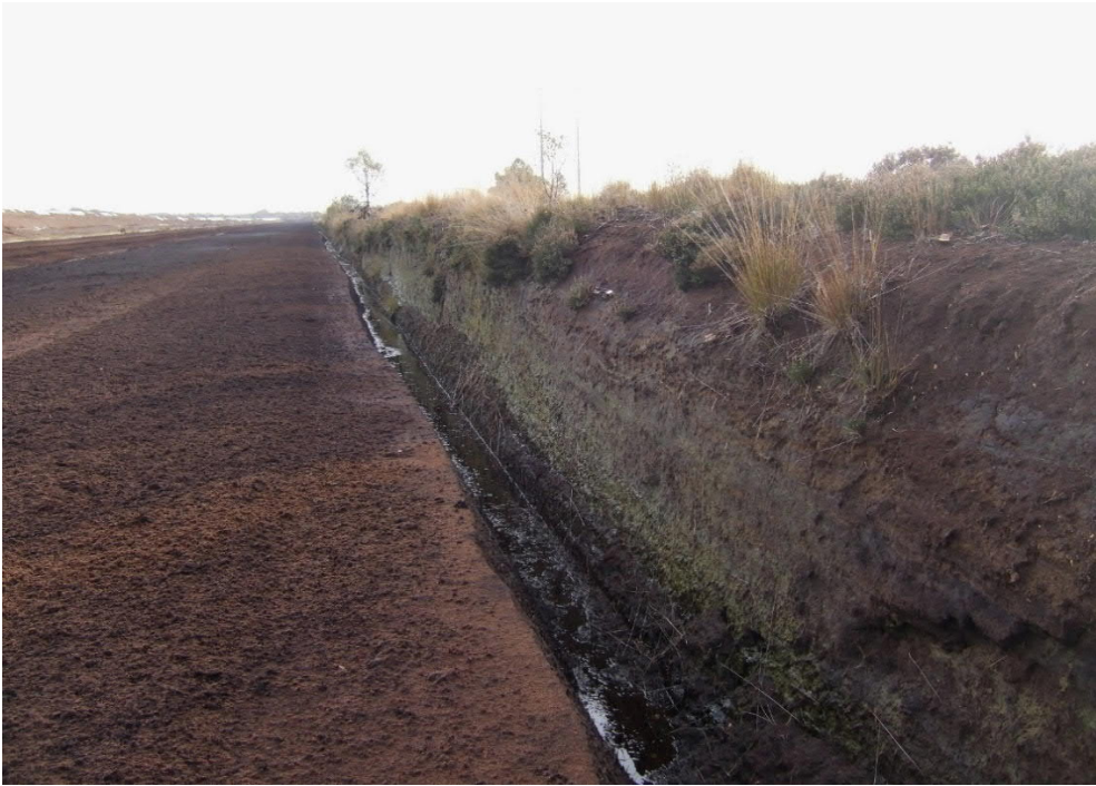
Figure 41: View of drain along edge of the high bog at Cornaveagh. Water seeps from the cut peat face