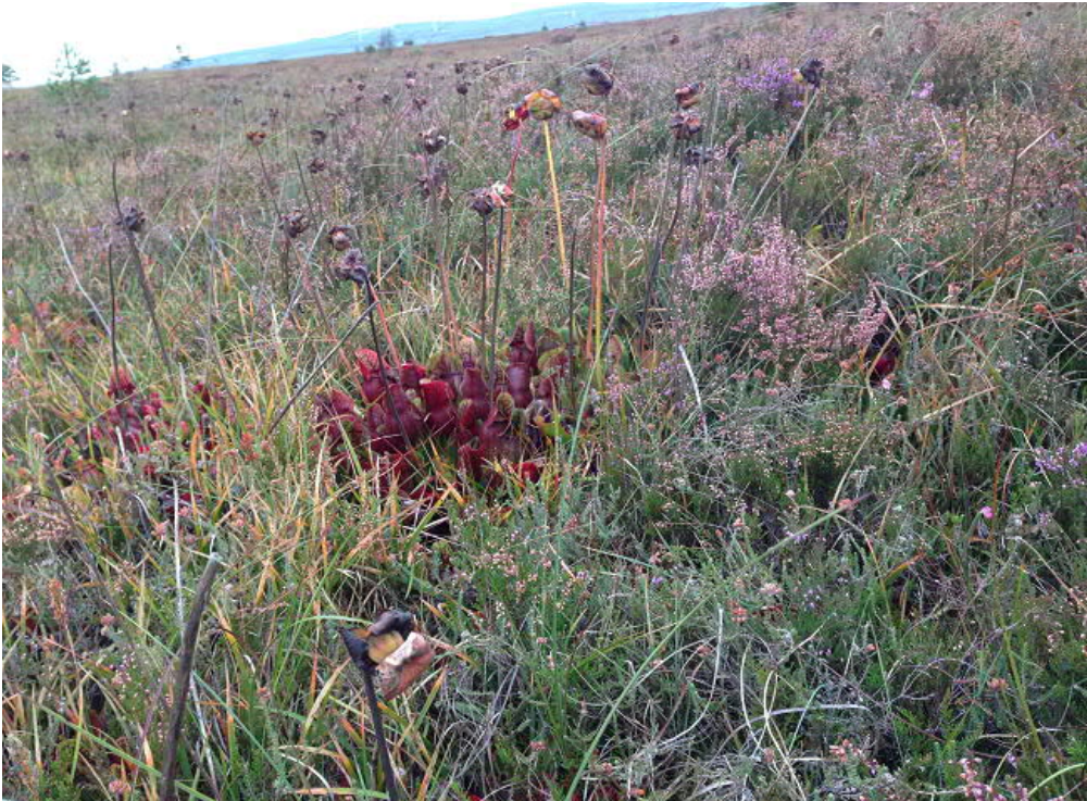
Figure 72: Invasive pitcher plant on intact high bog in the southeast of the Derrycashel Bog site