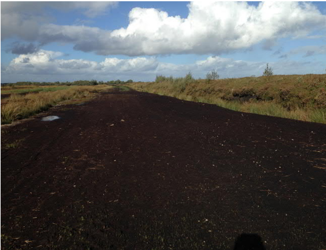
Figure 67: Photo facing north along western face of high bog at Cloonshannagh Bog