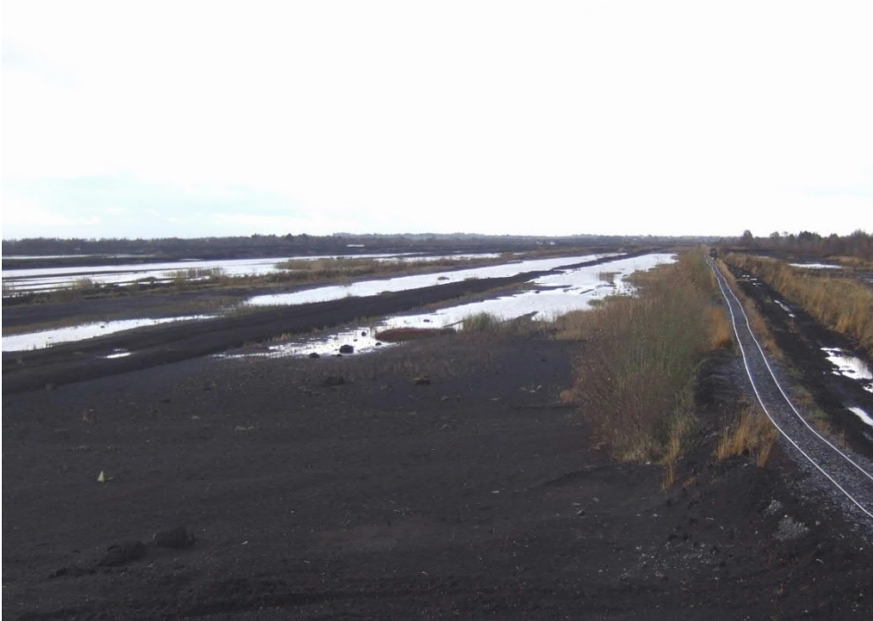
Figure 31: View of regenerating cutaway bog, sector D (looking westwards). Whooper swans have been recorded here