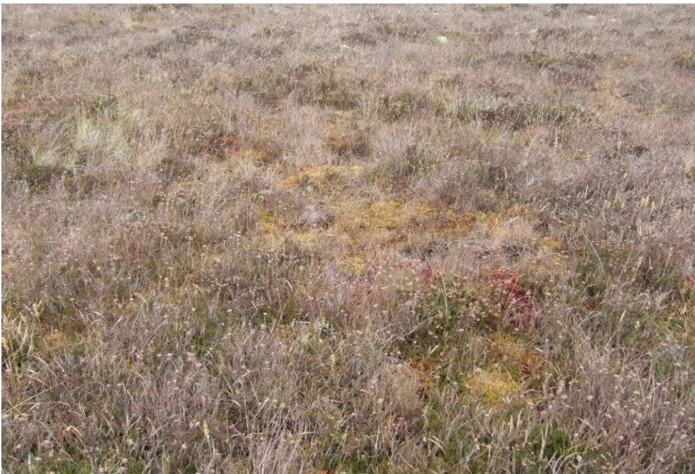
Figure 57: View of surface of the intact high bog at Clonad. The Annex I habitat Depressions on peat substrates (Rhynchosporian) is well represented in the wetter zone (November 2016)