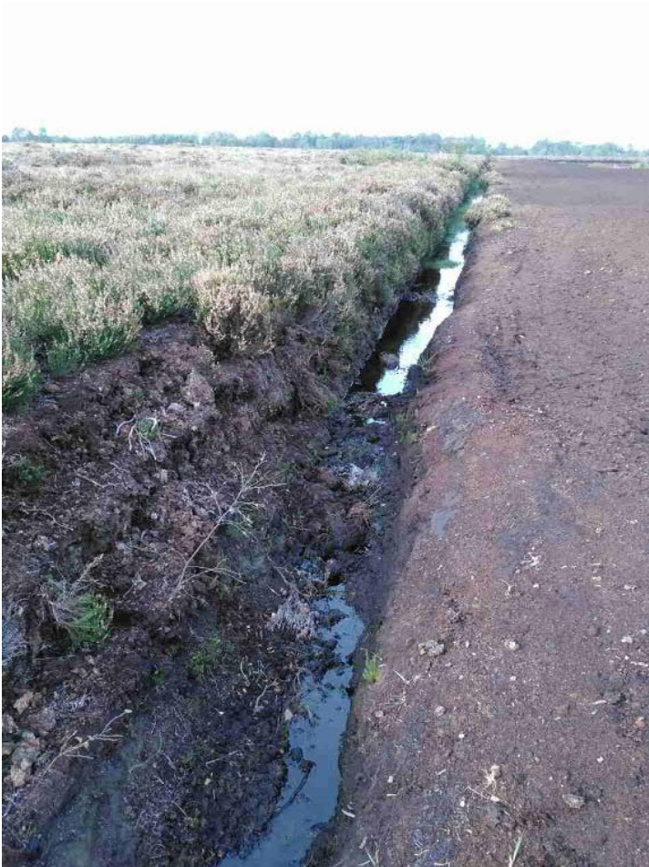
Figure 45: Drain between high bog in the south and the production area