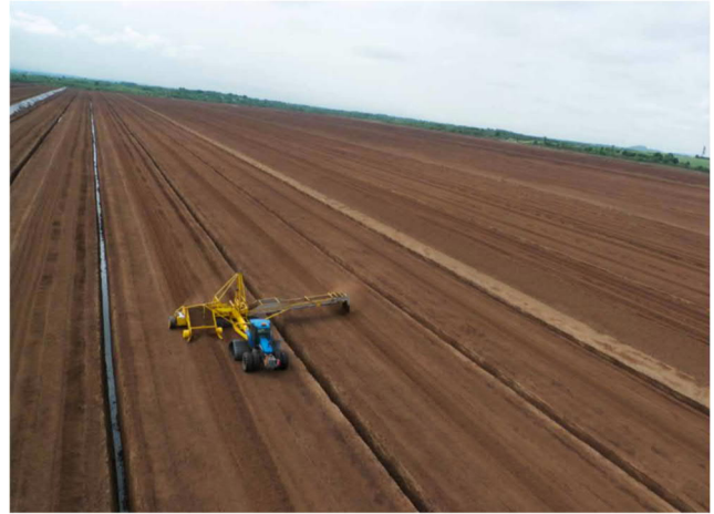
Figure 6: Harvesting (Peco)