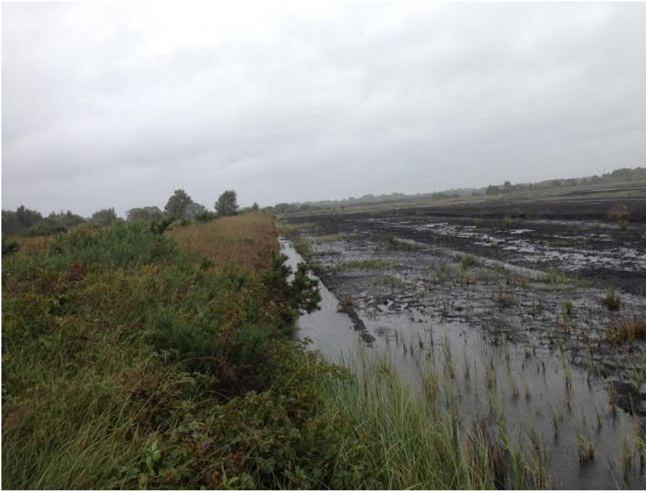
Figure 76: Drain between remnant high bog in the west of the site and the peat production area