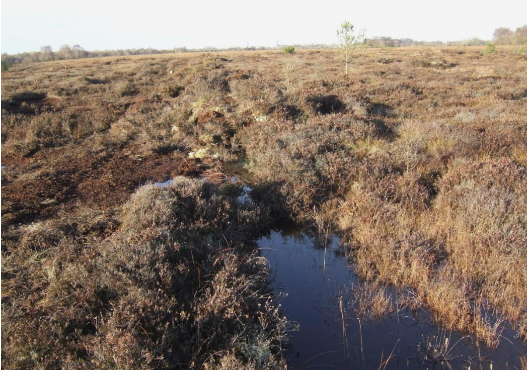
Figure 28: View of high bog in extreme northwest sector of Bunahinly Bog. View is looking northwards over a recently blocked surface drain. This bog conforms to the Annex I habitat Degraded raised bog