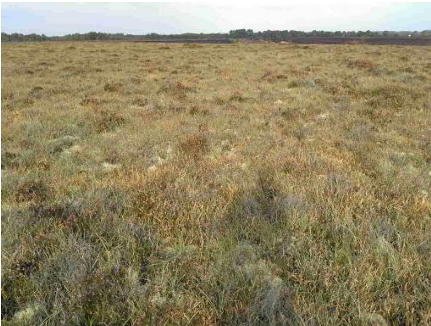
Figure 44: High bog at southern tip of Derryfadda Bog that supports Degraded raised bog and Depression of peat substrate of the Rhynchosporion