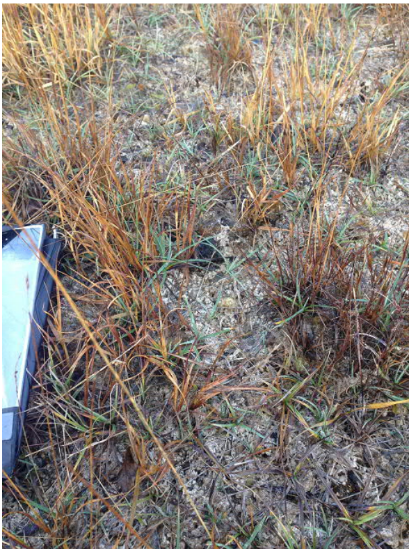
Figure 71: Tufa formation on Derryarogue Island biodiversity area