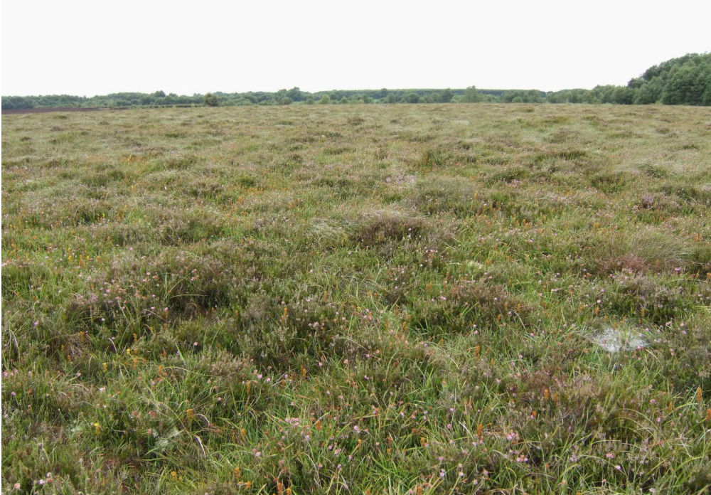
Figure 9: Derrinboy bog: northeast end of western sector (looking eastwards). View is of intact high bog (outside of but adjoining Bord na Móna property), which supports the Annex I habitats Degraded raised bog and Depressions on peat substrates (Rhynchosporian)