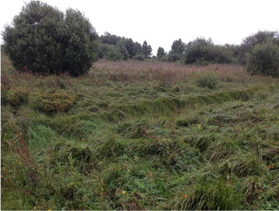
Figure 77: Reed and large sedge swamp (FS1) and wet grassland (GS4) adjacent to Bilberry River