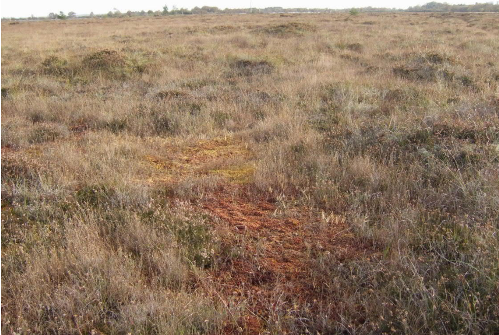
Figure 40: View of wet, quaking area on Cornaveagh Bog. This area supports active bog and Depressions on peat substrates (Rhynchosporian)