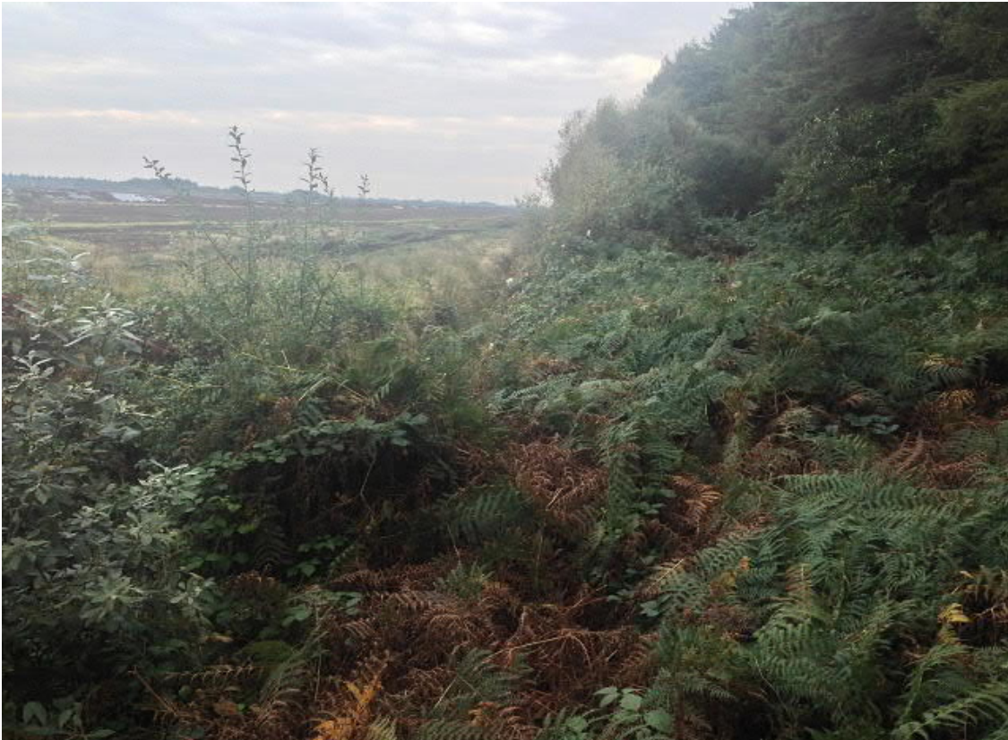
Figure 49: Photograph facing south along conifer plantation that separates the production area from Castle Ffrench Bog NHA. A deep drain also occurs at this point