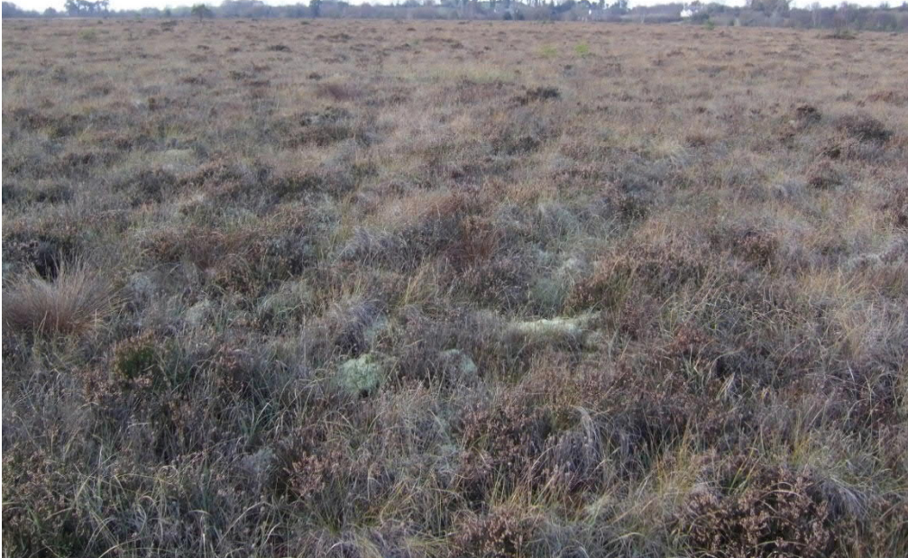
Figure 22: View of intact bog to north of road, northeast sector of Ballaghurt Bog. This bog supports the Annex I habitats Degraded raised bog and Depressions on peat substrates (Rhynchosporian). View is looking westwards