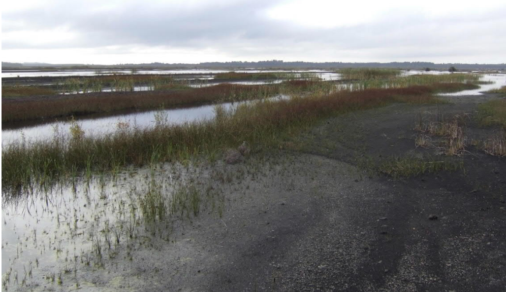
Figure 50: Much of the central area of Kilmacshane is re-generating cutaway– whooper swans winter here