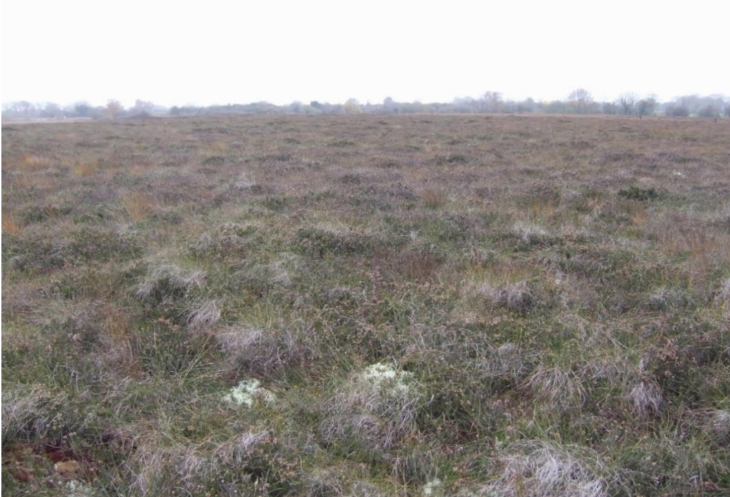
Figure 55: View of high bog which adjoins the southernmost sector of Ballykeane bog, looking southwards. The surface of this bog remnant is dry due to local cutting (November 2016)