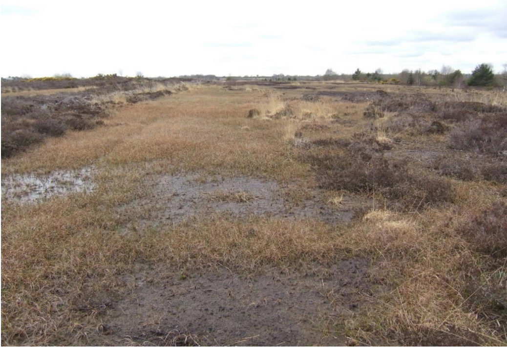
Figure 17: Leamanaghan Bog: view of high bog alongside commercial peat fields in extreme northern sector of site (looking southwards). This high bog is of Local conservation interest.