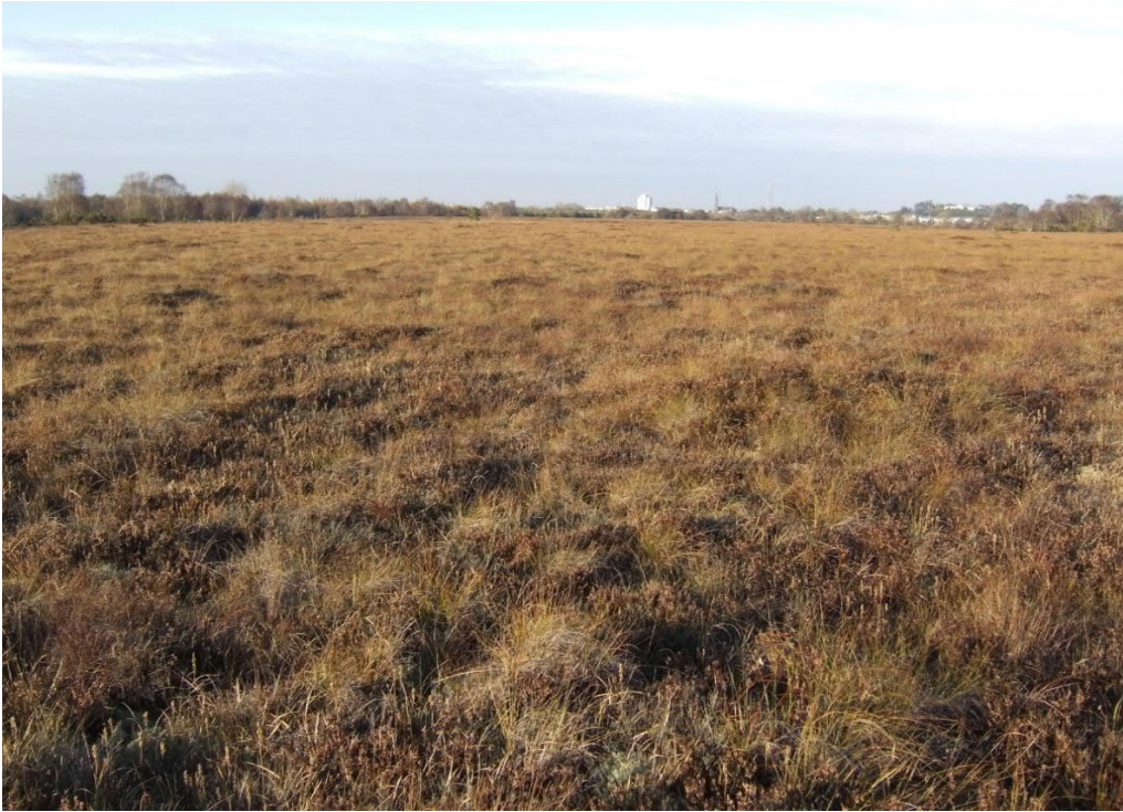
Figure 29: View of high bog to northwest of Bord na Móna site (looking north towards Athlone). This bog supports the Annex I habitats Degraded raised bog and Depressions on peat substrates (Rhynchosporian)