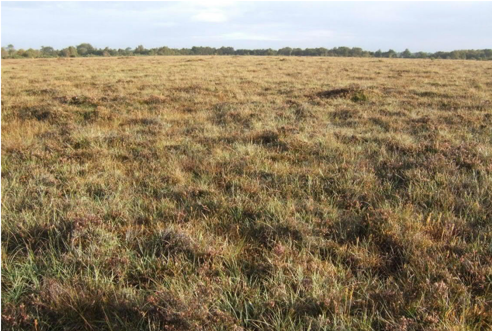
Figure 51: View of high bog in northwest sector of survey area. Part of this bog conforms to the Annex I habitat Degraded raised bog