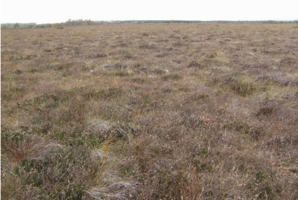
Figure 56: View of intact high bog in northeast sector of Clonad bog, looking northwards. This bog is classified as the Annex I habitat Degraded Raised Bog (November 2016)