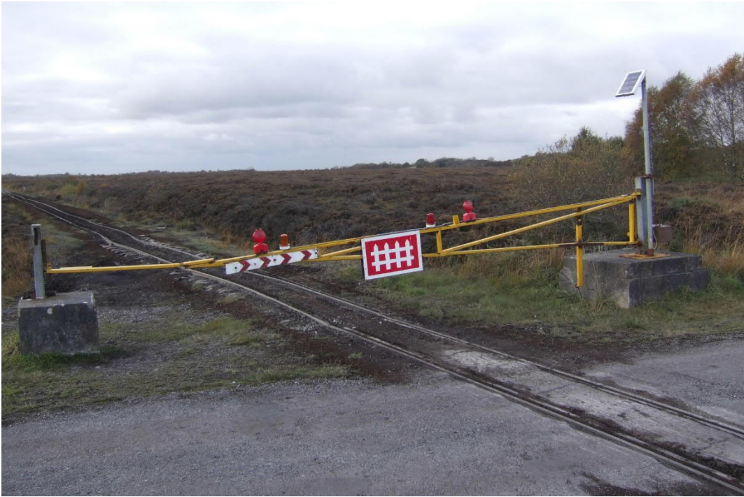
Figure 27: View of Mongan Bog SAC (right of rail track in picture). The Bloomhill Bog production area is separated from the SAC by a public road