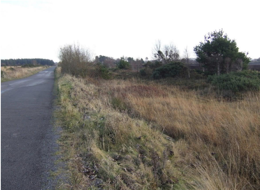
Figure 23: View of road and marginal strip (c.20 m wide) which separates the intact high bog from commercial peat fields. View is looking eastwards