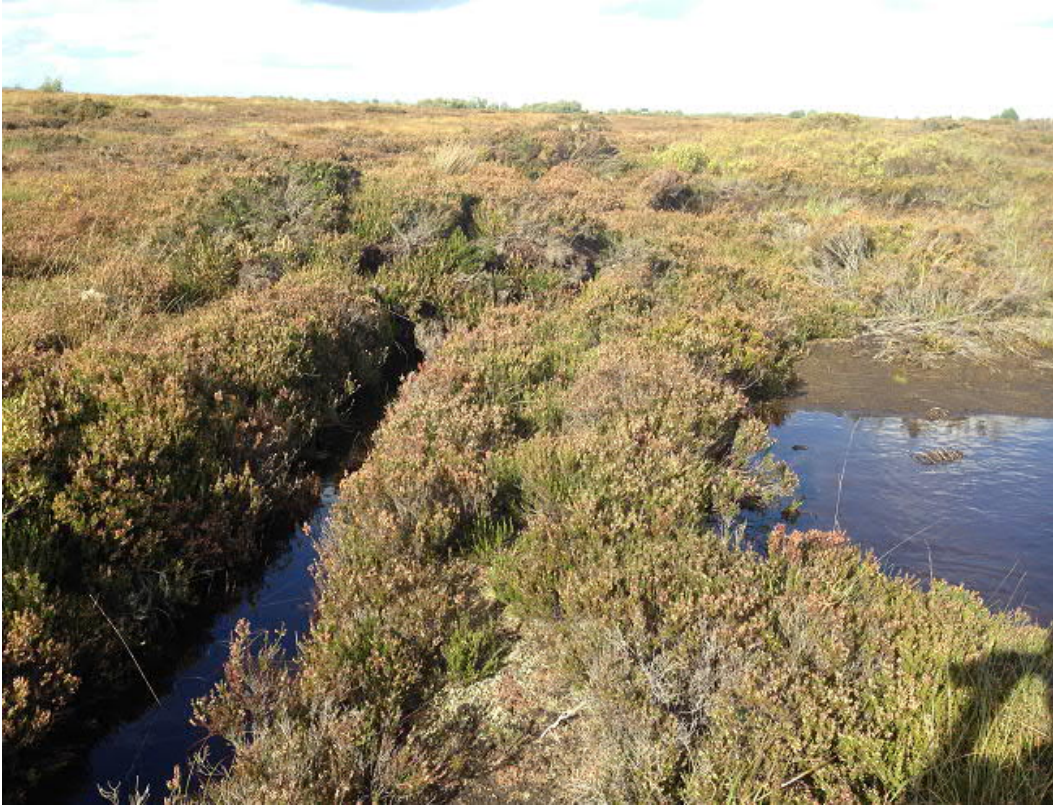
Figure 68: Dominance of Calluna vulgaris in dry areas around drains that have been blocked as part of rehabilitation process of high bog at Cloonshannagh