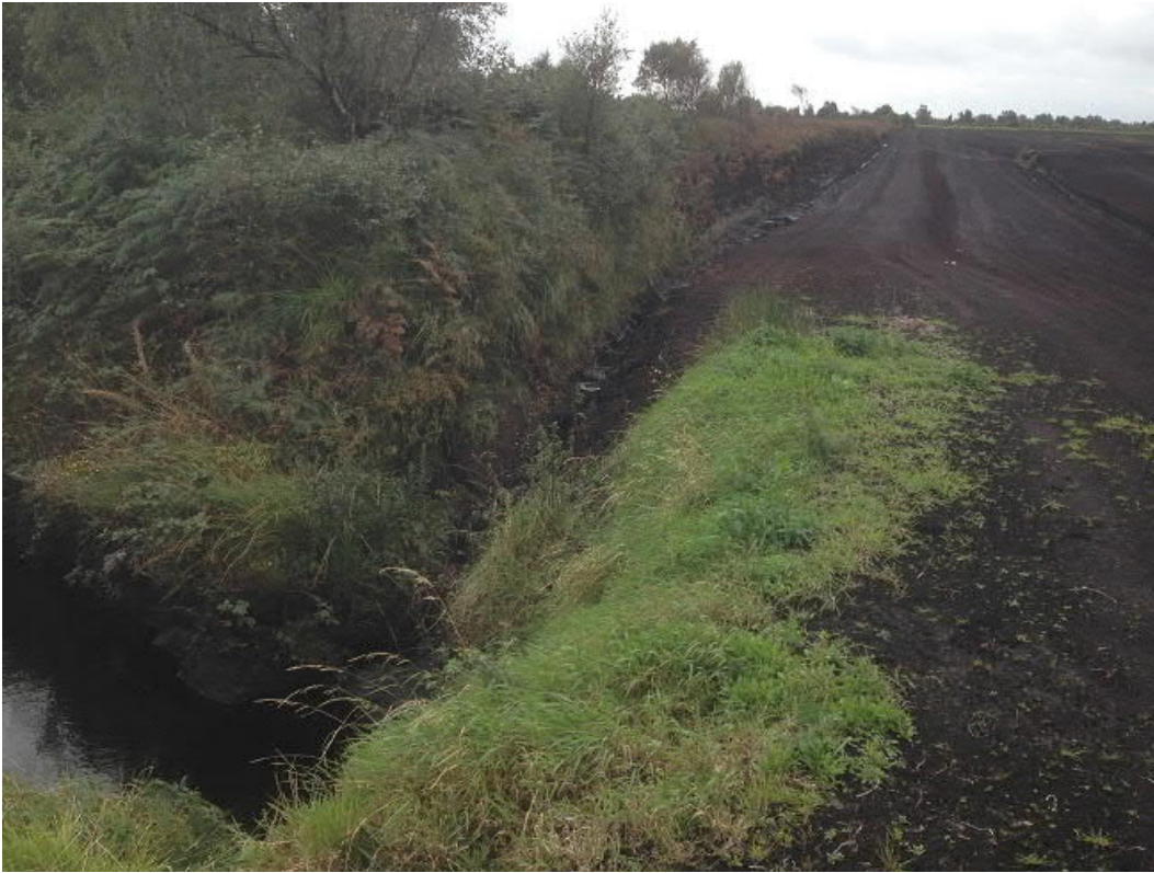
Figure 90: Photo facing south along bank face of high bog to the southeast of Moundillon bog. A small area of scrub (WS1) that fringes the high bog is also shown