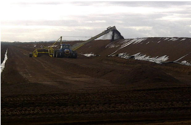
Figure 7: Stock Protection