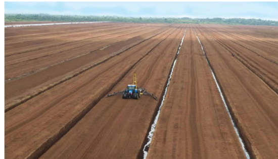
Figure 4: Ridging