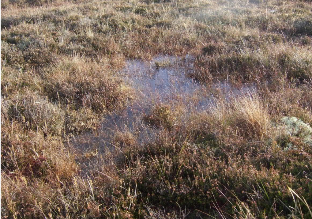
Figure 38: While the surface of the area of the high bog has been ditched, good recovery has occurred in places. View is wet bog which supports the Annex I habitat Depressions on peat substrates (Rhynchosporian)