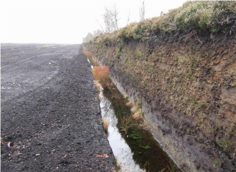
Figure 64: View of cut edge and drain along remnant high bog at northwest margin of Mountlucas bog, looking southwards. November 2016