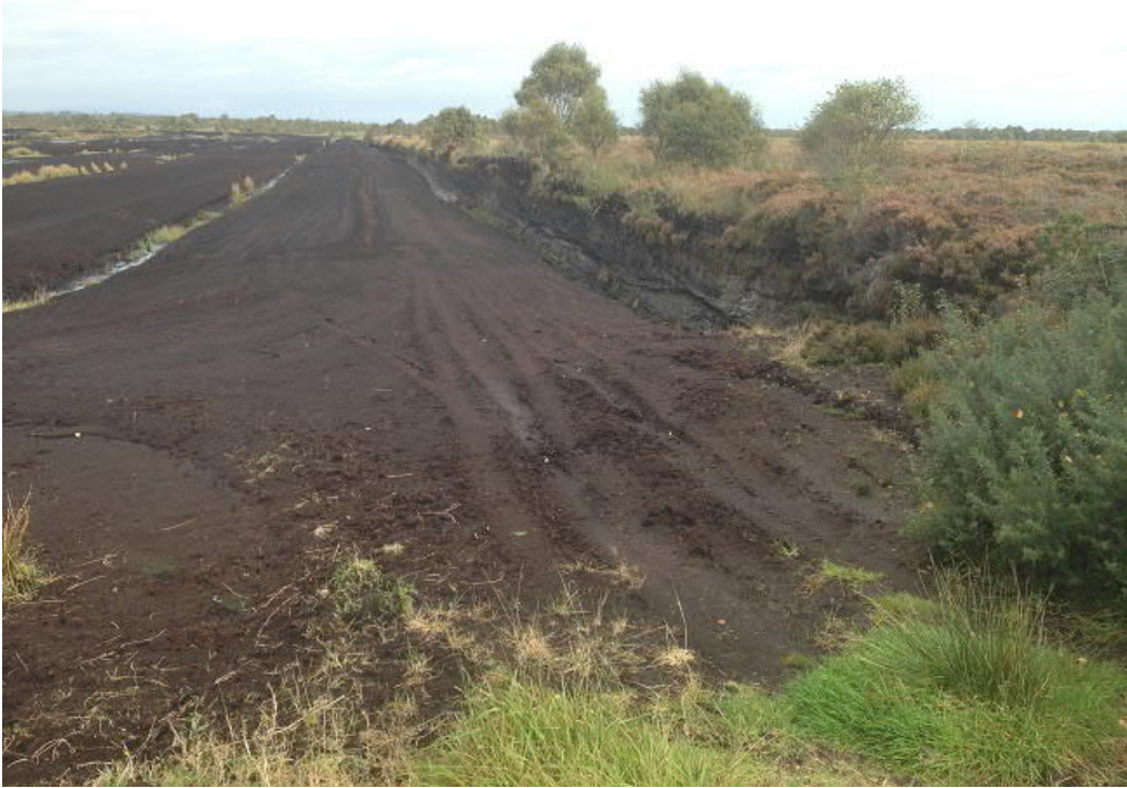
Figure 89: Bank face along the western edge of the intact high bog in the southeast of Mounddillon site