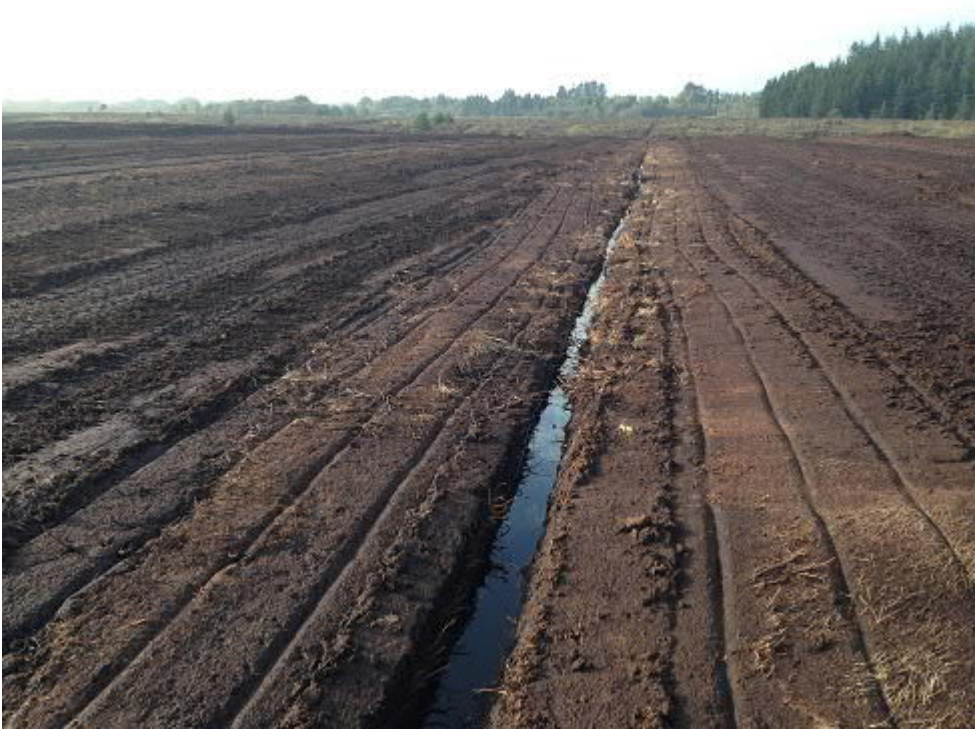
Figure 70: Recently screw-levelled bog on site