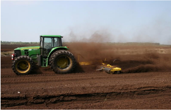
Figure 1: Milling

A stock field typically receives the crops from 10 fields i.e. five fields on either side. Weather permitting, the miller follows the harvester and the production cycle recommences in the emptied fields. Each production cycle is known as a harvest. In a year, of average weather conditions, approximately 12 harvests are completed. When the production season is over, the stockpiles are covered to keep the peat dry, unless the peat is scheduled for immediate sale. Peat is stored in these stockpiles until they are required for use.