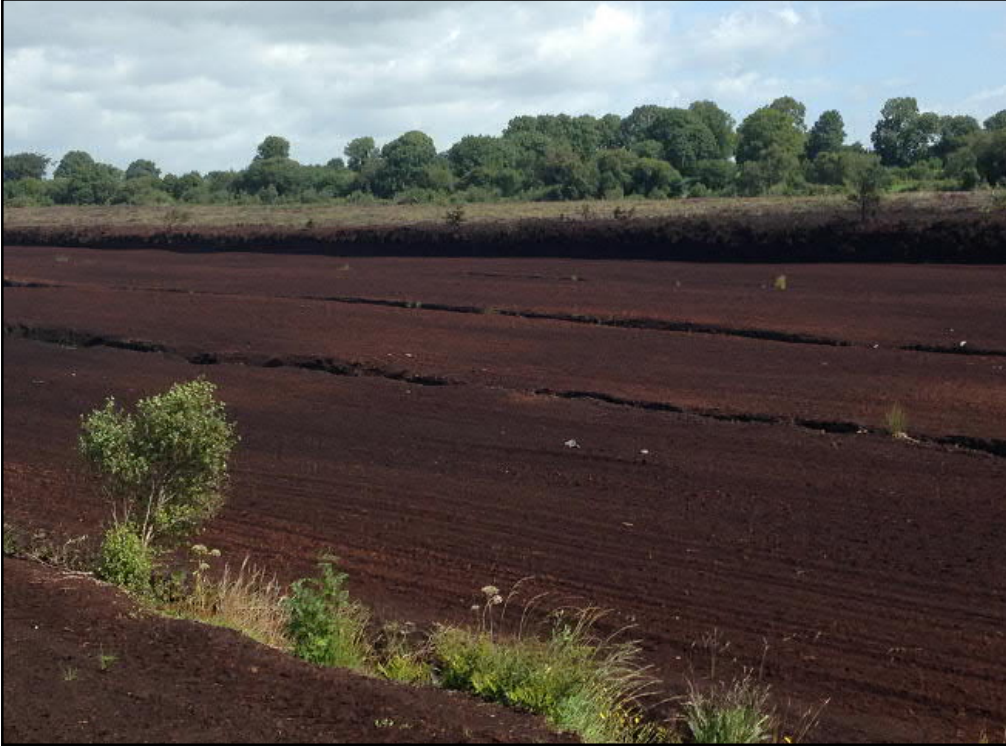
Figure 86: Active production field and bank face adjoining high bog biodiversity area in the east of the site. This area is immediately north of Derry Lough pNHA. The photograph faces east.