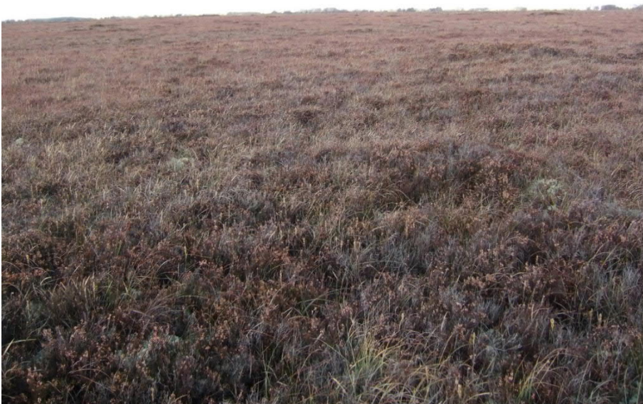
Figure 32: View of extensive area of raised bog to north of sector C (looking northwards). This bog is classified as Degraded high bog.