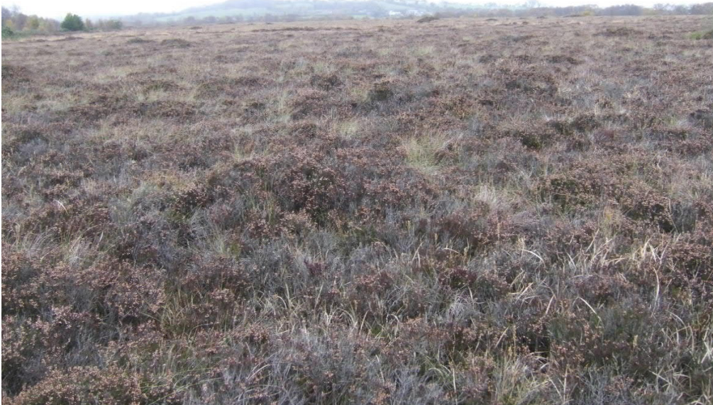
Figure 65: View of high bog along northeast margin of Mountlucas bog, looking north-eastwards. The surface of this bog remnant is relatively dry and has been disturbed in places. November 2016