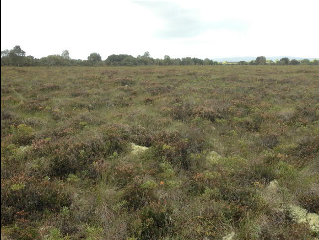
Figure 81: Remnant high bog (PB1) located along the western boundary of the site which supports the Annex I habitats 'Degraded raised bog' and 'Depressions of peat substrate of the Rhynchosporian'