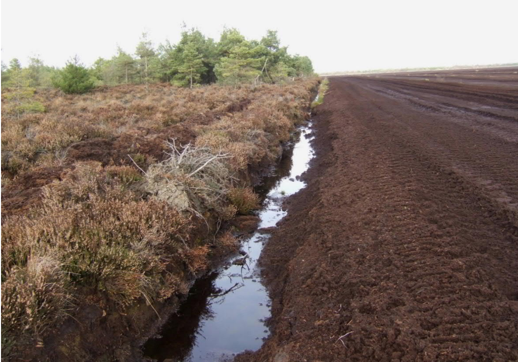
Figure 14: Derryclure Bog: the biodiversity area is edged by deep drains – this is contributing to the drying of the high bog which aids the spread of pine trees into the remaining open areas of high bog