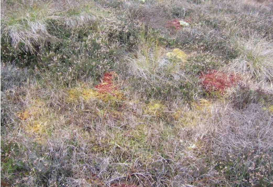
Figure 63: View of surface of high bog along northwest margin of Mountlucas bog. The surface of this bog remnant is wet in places with good Sphagnum cover. November 2016