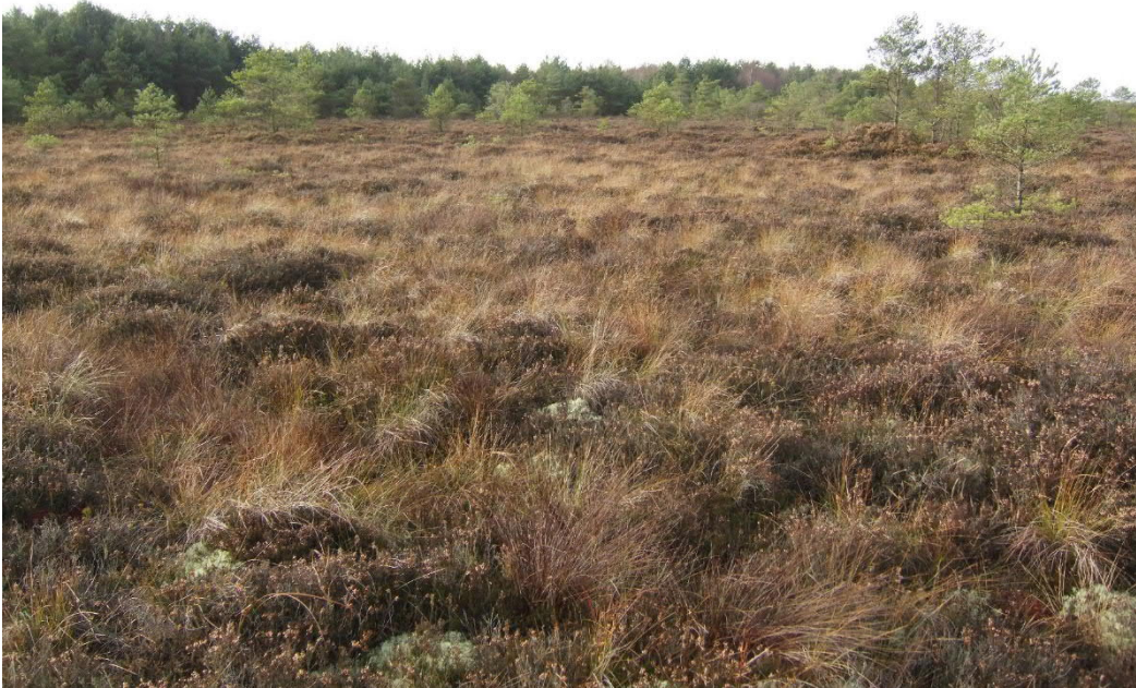
Figure 12: Derryclure Bog: view of high bog with encroaching pine trees within the Bord na Móna biodiversity area