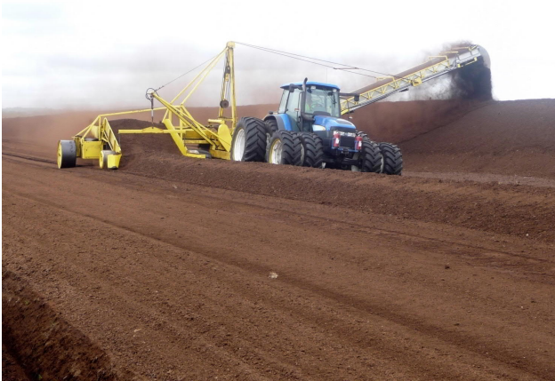
Figure 5: Harvesting (Peco)