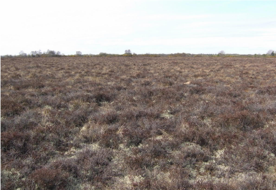
Figure 20: View of intact high bog along southwest boundary of Ballivor Bog. The Annex I habitats Degraded raised bogs still capable of regeneration and Depressions on peat substrates (Rhynchosporian) are represented here.